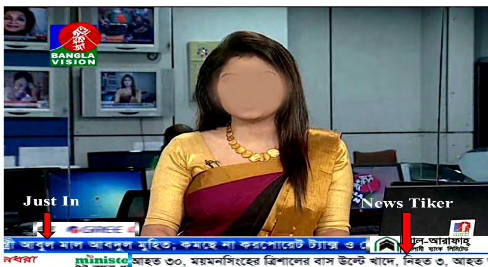
Figure 4: Just-In and News Ticker (Self Captured)

Just-In refers to those news updates which are provided in a very short and incomplete line containing the main gist of the news. It appears at the bottom of the TV screen above the News Ticker. This line is known as Just-In. It is like News Ticker, but it is only a follow up or update of the news item which is already being broadcast.