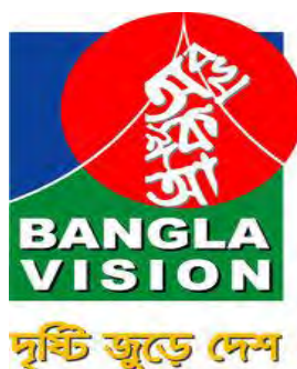
Figure 1: Logo of Banglavisision Television