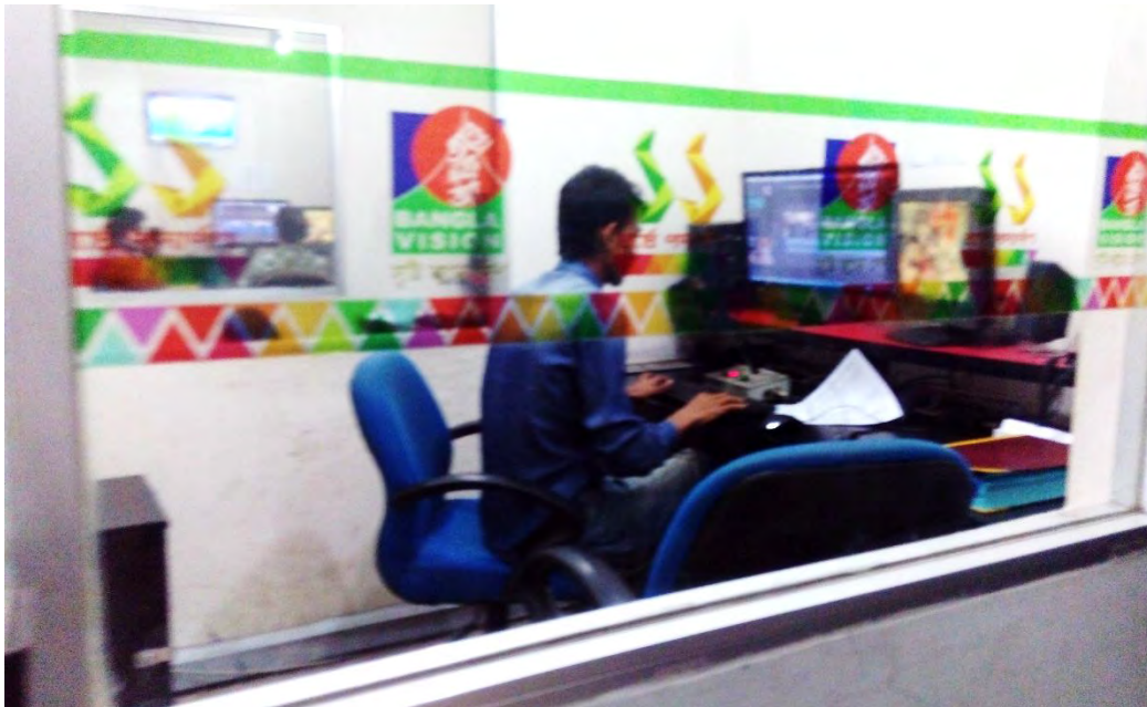
Figure 3: Banglavisión Television Panel Room