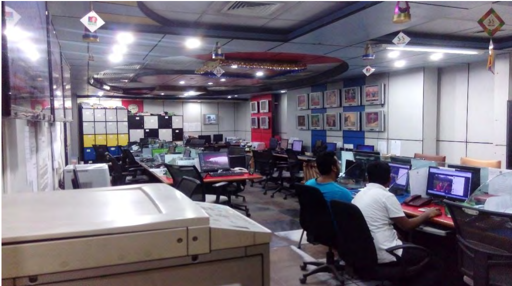
Figure 2: Banglavisision Television Newsroom (Self Captured)