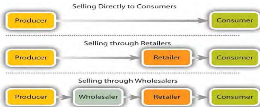
Figure: Distribution channels

K. Ali flour mills might be the only flour mill in the country that uses all the distribution channels. First, we sell directly to consumers and there are no intermediaries. Second, we sell our products through retailers and retailers sell them to consumers. Third, we sell products to wholesalers and wholesalers sell to retailers and then retailers sell them to consumers.