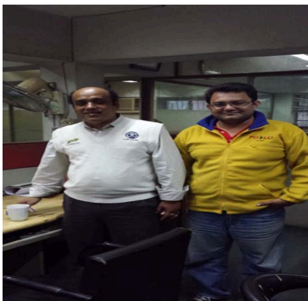
Editor and Senior Sub-Editor of Sports, New Age