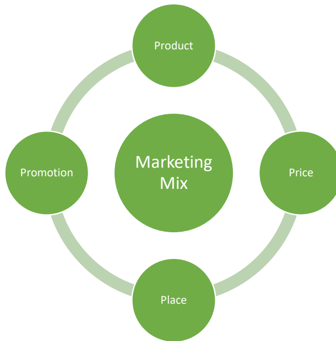
Figure 2: Marketing mix