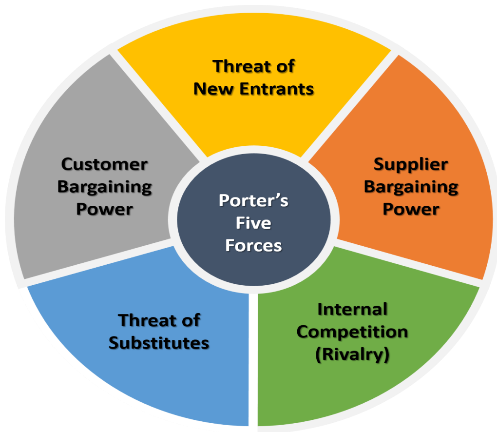
Figure 3-Porters Five Forces