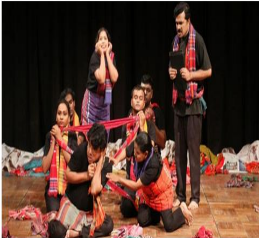
A scene from Tringsha Shatabdi

Theatre troupe Swapnadal will stage its acclaimed anti-war play Tringsha Shadabdi at a performing arts festival in Japan titled 'Festival/Tokyo 2018', which will be held from October 13 to November 18.