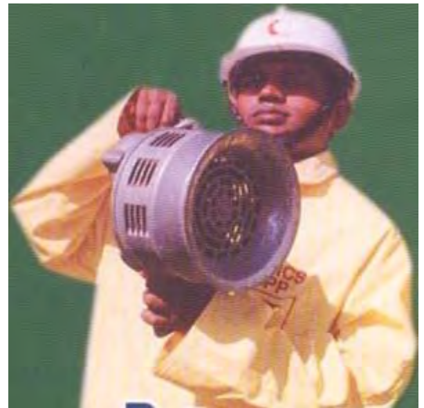
Figure 5: CPP volunteers disseminating warnings by megaphone and hand sirens.