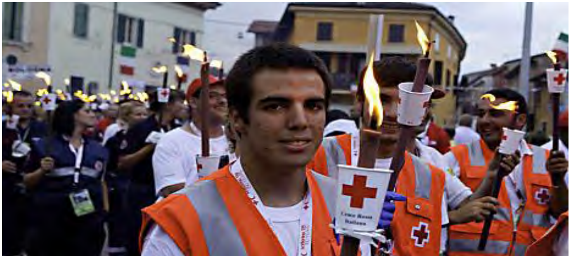
Figure1: Celebration of the Red Cross day

The International Committee of the Red Cross (ICRC) established in 1863 as an impartial, neutral and independent organization whose exclusively humanitarian mission is to protect the lives, the dignity of victims of war and internal violence and to provide them with assistance. It directs and coordinates the international relief activities conducted by the Movement in situations of conflict. It also endeavours to prevent suffering by promoting and strengthening humanitarian law and universal humanitarian principles. At the ending of our Liberation war in Dhaka city, two installations Hotel Intercontinental and the Holy Family Hospital were protected from air raid and other war-related incidents.