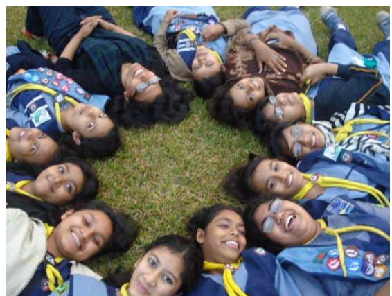
Figure 3: Scouts activity

As a global movement, making a real contribution to creating a better world; we see Scouting entering its second century as an influential, value-based educational movement focussed on achieving its mission, involving young people, working together to develop their full potential, supported by adults who are willing and able to carry out their educational role.