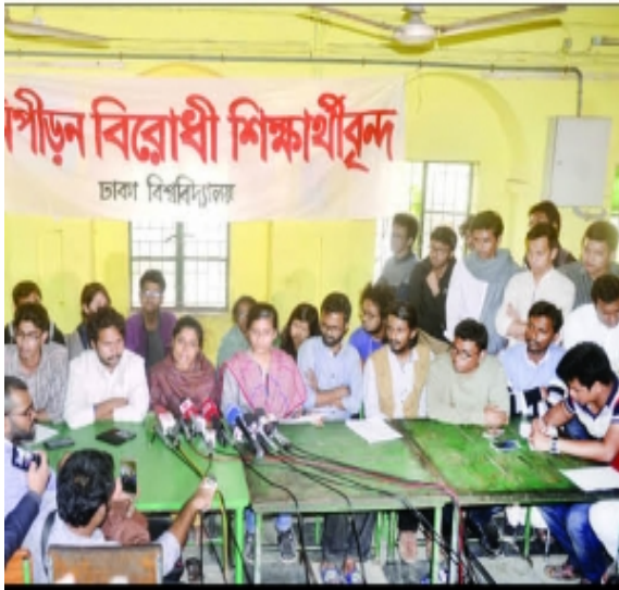
ents, under the banner of Nipiran Birodhi Shikkharthi Brinda, hold a press Canteen on the campus on Wednesday a day after they were assaulted by rs and activists. Report on page 1

ing second home in Malaysia, Muhith informed the House that BFIU has already given information to ACC after collecting information from respective Malaysian authority.