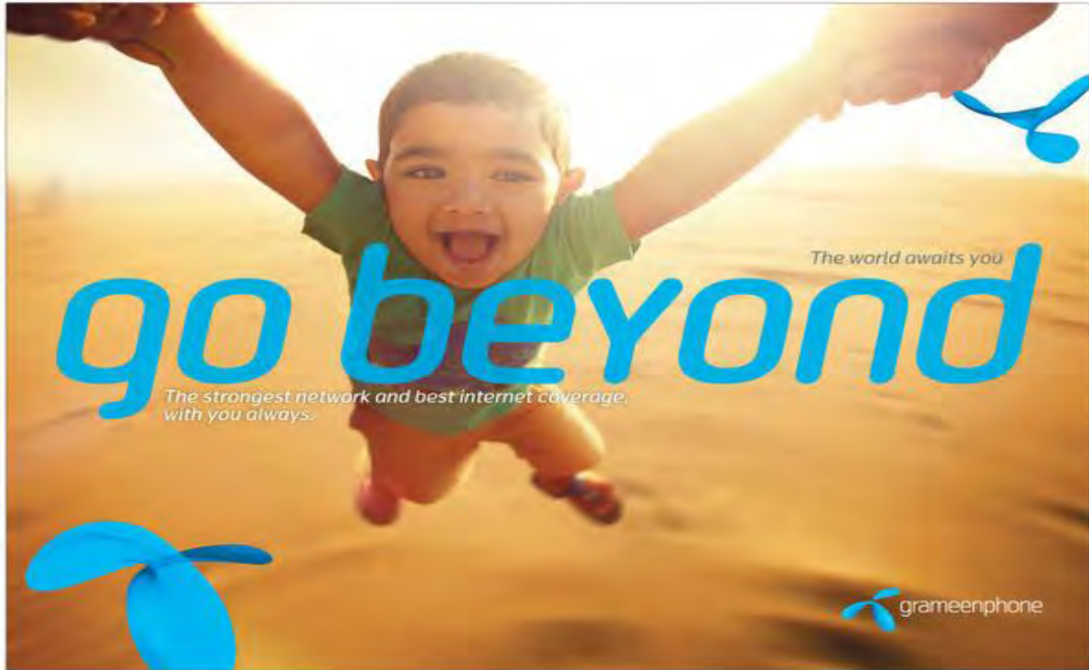
Fig03: Slogan-“Go Beyond”