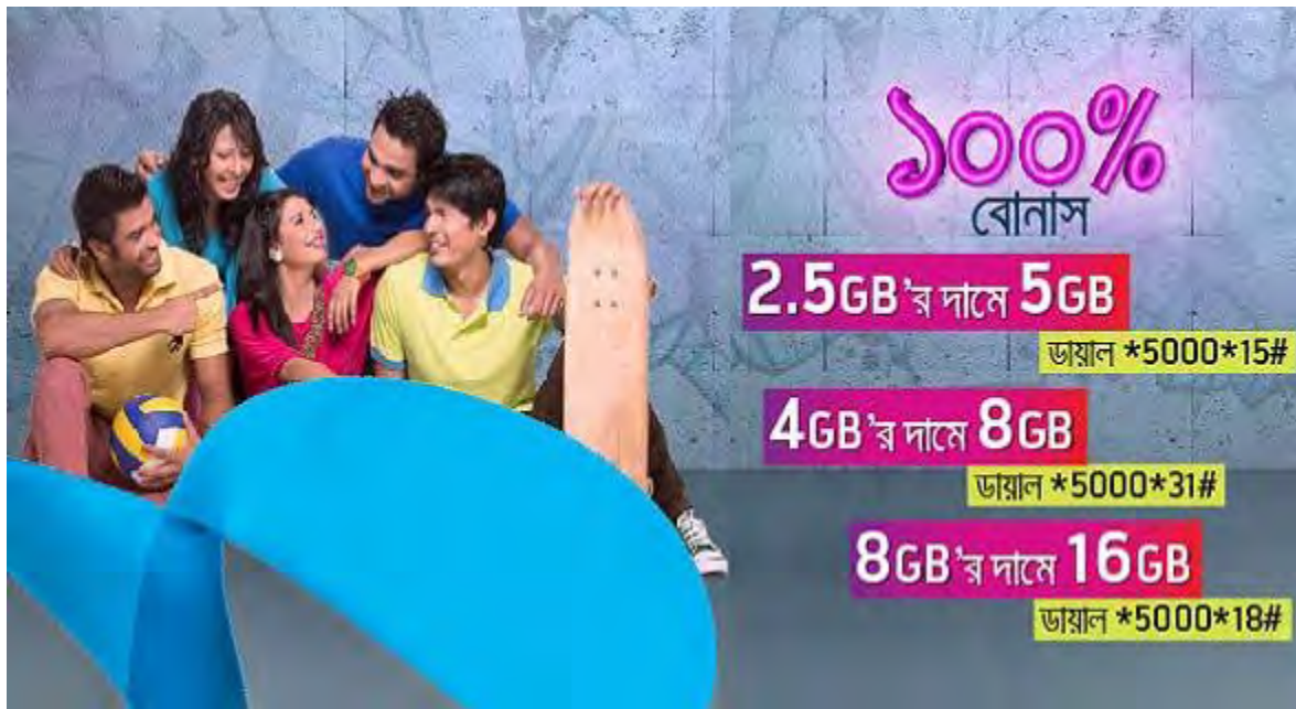
Fig 5: GP internet Offers for youth

In GP, they follow the campaign analysis to make best marketing plan. Campaign that provides the highest value can be easily be identified, making it easier to confirm that market spend is being used efficiently. By performing the campaign analysis, the company gets not only to withdraw the poor market spend and the poor campaign but also to concentrate on the highest campaign to make more profit out of this. Grameenphone always concentrates on campaign analysis to analyze and research the market.