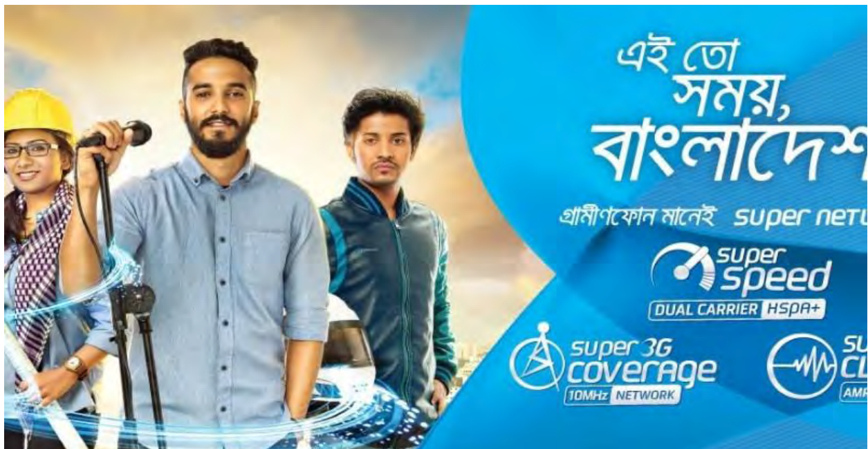
Fig 04: Advertisement of Super-Fast 3G Speed of Grameenphone

Range scope has ended up being a critical request driver for cell administrators. Since the imposing business model was lifted and the phone administrators started their operation in the market, the system scope of mobiles has extended drastically. As of now both GP and TMIB covers 61 out of 64 areas of Bangladesh. Cell administrators, along these lines, have made a parallel system to that of settled lines in Bangladesh. Since the cell endorser base is twofold to that of the BTTB lines, it is, along these lines, no more basics to have BTTB network.