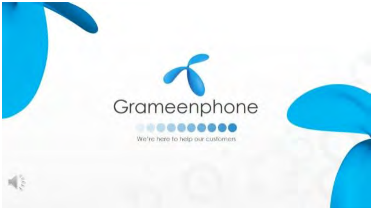
Fig 01: Grameenphone- Bangladesh's leading Telecom Brand

Telecommunication media has added a new aspect in this modern era. In this modern world, telecommunication media is of great importance to us. Cellular phones have been an invincible part of our daily life. Since 1991, mobile phone companies in Bangladesh have been playing a vital role in the economic development and life style of the people. Among all these, Grameenphone Limited is the leading telecommunications service provider in Bangladesh, who got operating license in November; 1996. It started its journey in March 26, 1997. It has now become the largest telecom group with more than 56 million subscribers. It was the first company to introduce GSM technology in Bangladesh and built the first cellular network to cover 99% of the country. Grameenphone provides services to the rural and urban people all over Bangladesh where mobile phones are acknowledged as a significant driver for social economic development for the nation.