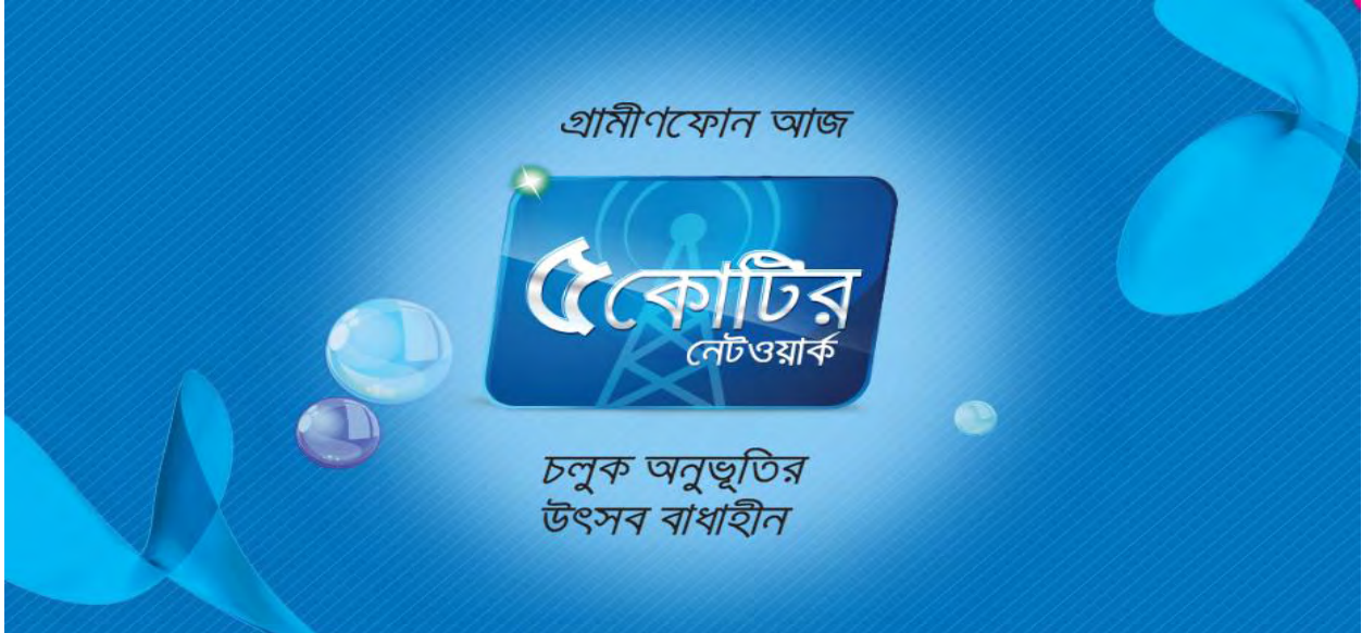
Fig 02: Grameenphone's No. of Subscriber reaches 5 crore