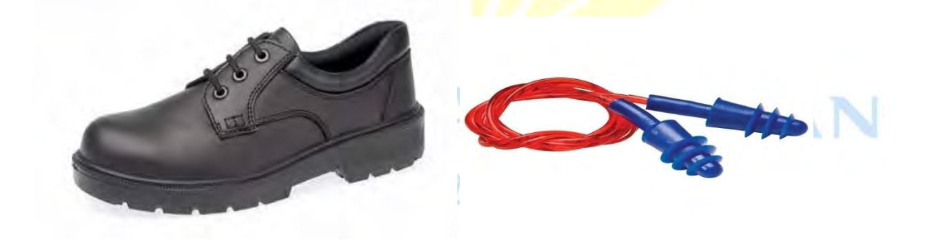
Figure 5: Safety equipments – 2

Whoever is working in risky zone or engaged in dangerous job, he must have to wear safety helmet and hand gloves. Even the employees are bound to wear the safety helmet when they got to monitor worker's job.