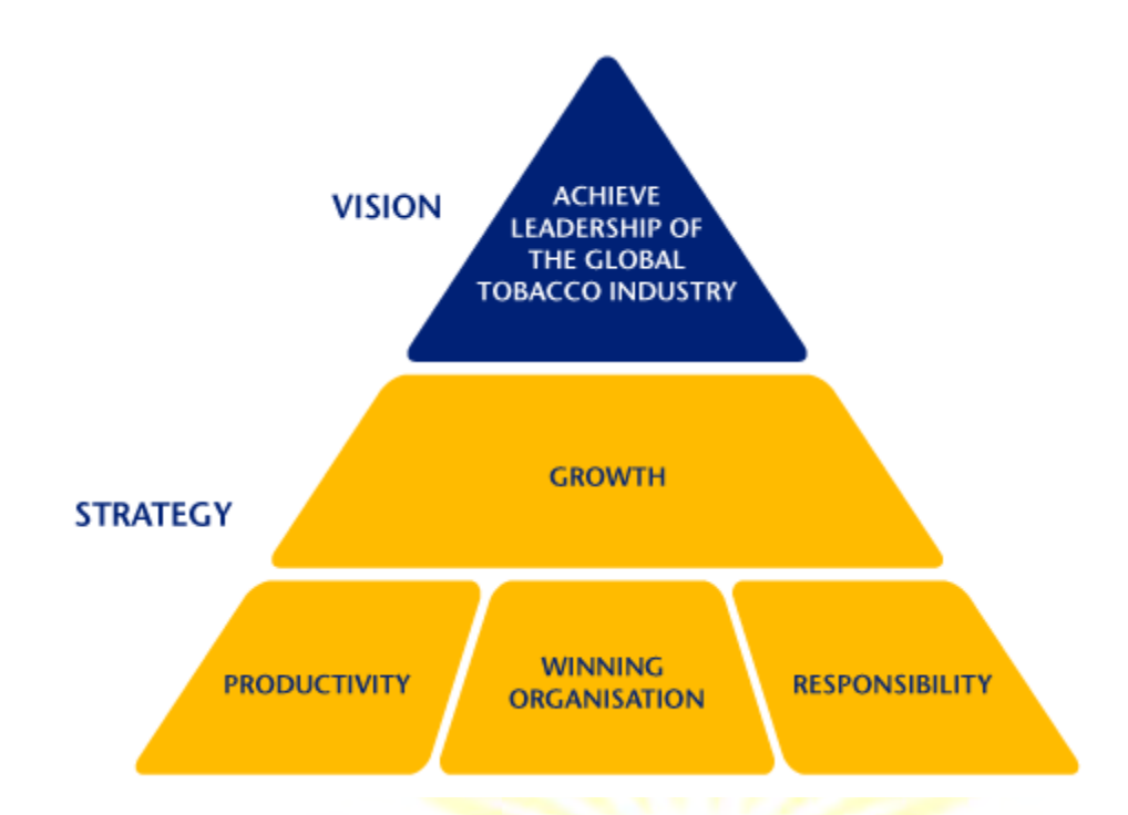
Figure 2: Strategies taken by BAT to accomplish their Vision

3.5Functional departments: