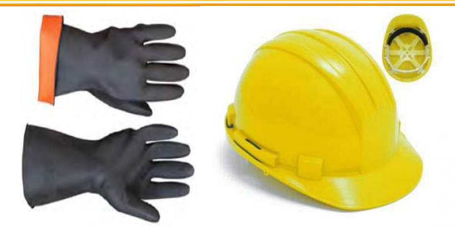
Figure 4 safety equipments - 1