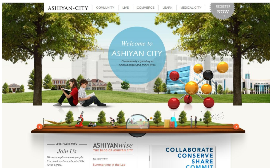
Image of Ashiyan Group Website

Ashiyan Group has an existing website which they built up 3-4 years ago. Now they are planning to sell their product internationally. So they want to develop their website exclusively where their all information will be shown attractively. If a company wants to be famous in international market they must need a website which looks better. Their existing website is not so attractive, so they demanded an exclusive site to us and Bengal Solutions Limited can give them such type of website. BSL has a competitive expertise of constructing of international websites and they have diversification in designing. Beside this, Bengal Solutions Limited can provide all types of IT solutions to the customer and the product quality is very high.