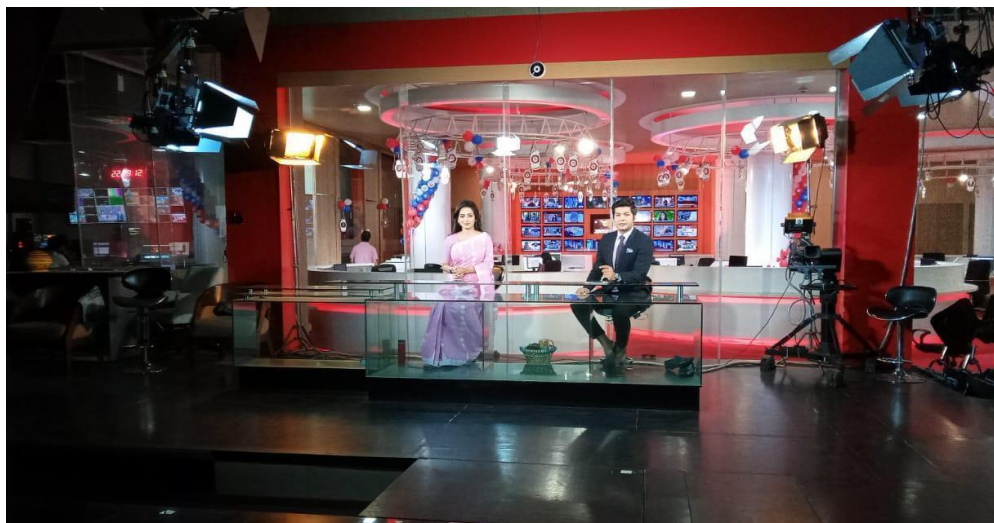
Fig 5: NEWS24 Studio

NEWS24 News Studio is where programs are pre-shooted and where all the news broadcasts take place. NEWS24 has two very organized news studios. For different programs, the sets of the studios are recreated. One studio is a virtual studio for pre-recording programs. This part of the Studio contains cameras from different angles and green backgrounds for the graphic