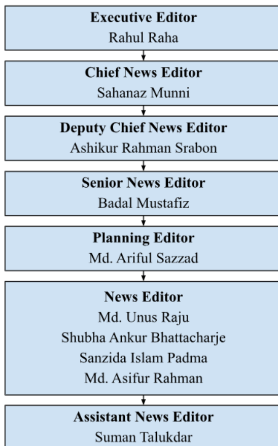
Fig 2: Organogram

This is the current hierarchy chart of NEWS24 . As for the main organogram, the Managing Director manages the organization's four central departments: Broadcast Operation, HR and admin, News and Current Affairs, and IT. The News and Current Affairs department has two sections in the hierarchy table. They are the Senior News Editor and Head of News. The Head of News assigns the editor, senior broadcast, broadcast journalist, and correspondents.