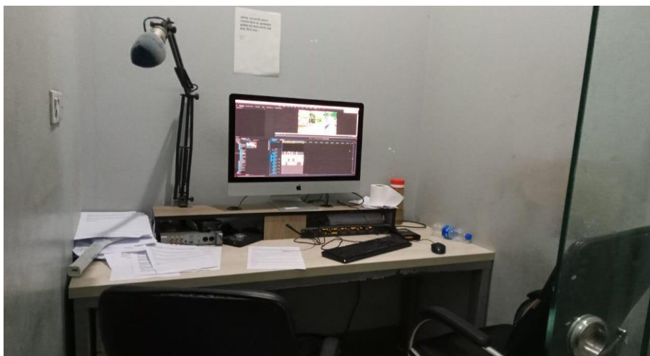
Fig 6: Video editing Panel

In the video editing panel, the video footage of the news is edited. People can relate to the news if the video matches the situation or the news. NEWS24 has seven video editing panels. Desk reporters, field reporters, and responsible newsroom editors download the video of their news and upload it to the joint server of the video editors. After that, the editors edit the video, maintaining copyright rules. With the instructions from the reporters, the editor adds background music and sequences the video to visualize the news story perfectly. The desk reporter or