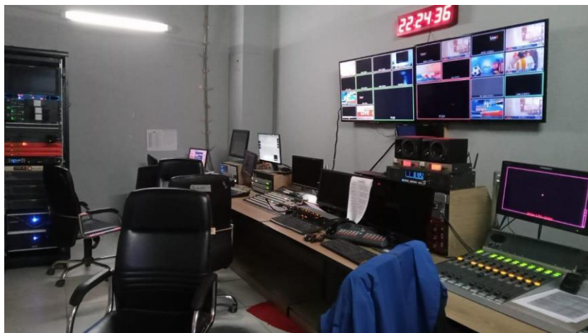
Fig 7: NEWS24 PCR

The Master Control Room (MCR) and Production Control Room (PCR) are closely connected to news broadcasting. PCR works to coordinate the news broadcasting. The NEWS24 Production Control Room is attached to the News Studio containing monitors. The PCR has access to the video footage and soft copies of the news. They assist the production team when the