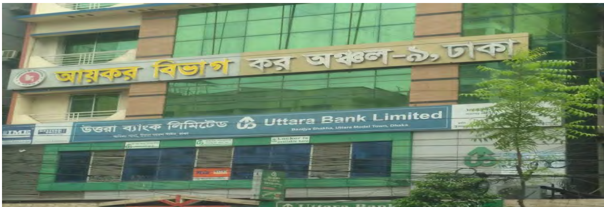
Figure 12- Bangla only

Only 4% of the still images contain only Bangla and absolutely no presence of English is seen, not even in a transliterated form. However, comparing the other categories found in the linguistic landscape of Dhaka city, it is the lowest.