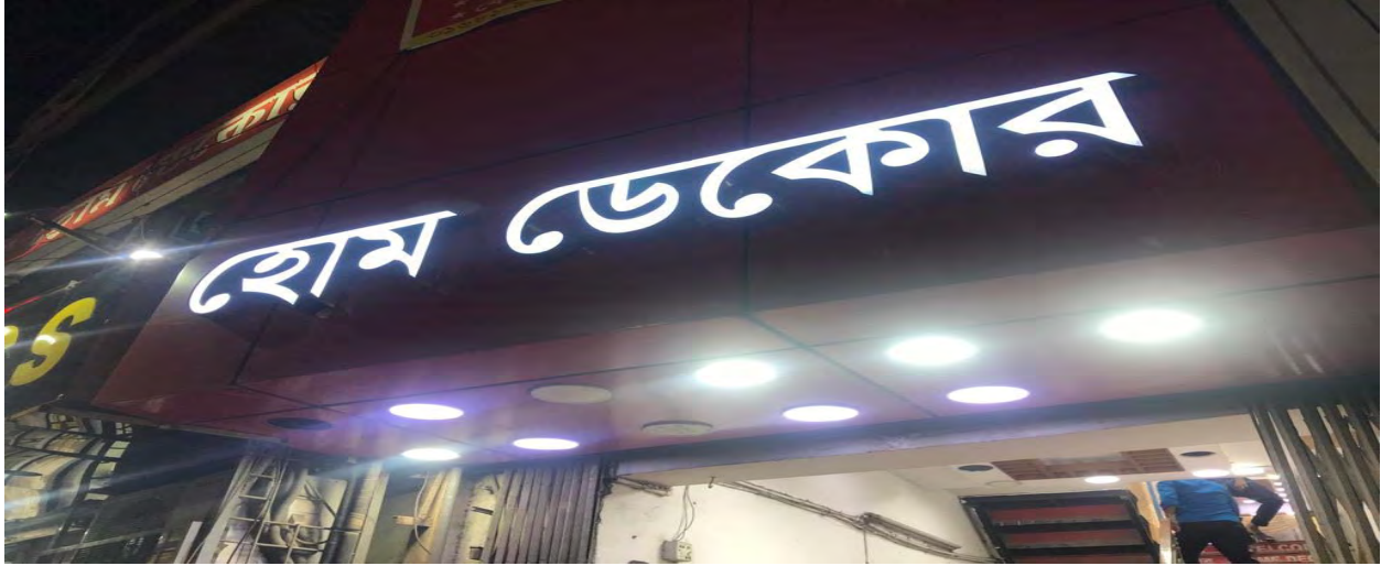
Figure 11- English transliterated into Bangla

8% of the collected samples have been found to contain English language to be transliterated into Bangla and no presence of English letters or words themselves. In Figure 11, although the name of the shop is written in Bangla letters, the name, 'Home Decor' is originally an English one.