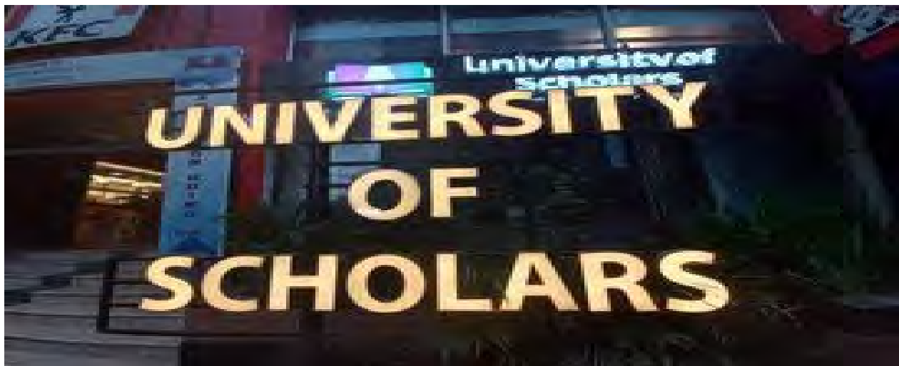
Figure 4- English only

Figure 4 is a 3D alphabetical advertisement of a university which is also electrically lit with golden lights. A signboard of an educational institution completely in English also shows a subtle economic investment in making it. Education in English is no longer limited to a few “English manor born”, rather it has become a profitable global business where wealthy elite society is paying a handsome amount for their children’s education, especially for them to receive literacy in English (Preece, 2009). English is associated with modernity, advancement, internationalism and perhaps, this could be a potential factor behind the mountainous usage of this language on the Linguistic Landscape of non-native countries (Cenoz & Gorter, 2008). Signboards of figure (2-4) serve mostly symbolic functions of a language.