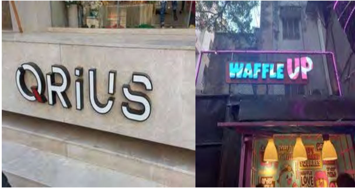
Figure 2- English only