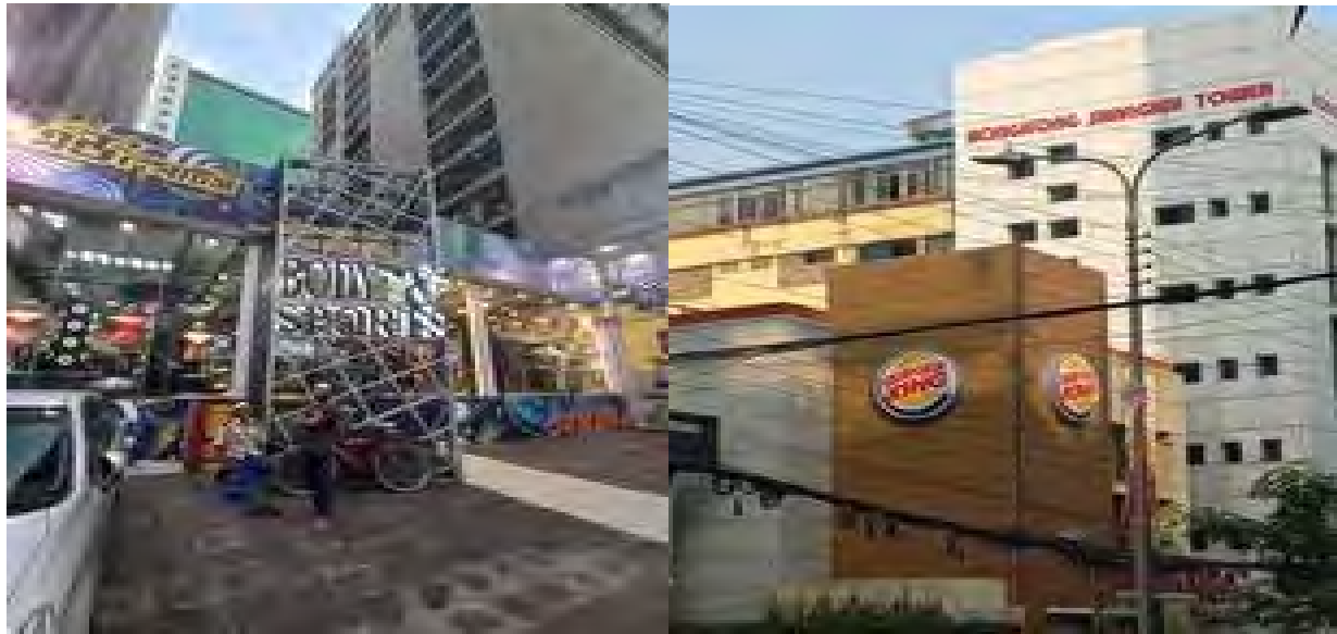
Figure 3- English only