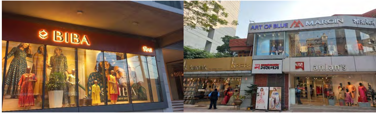
Figure 5 - Language Mixing and Language Hybridization