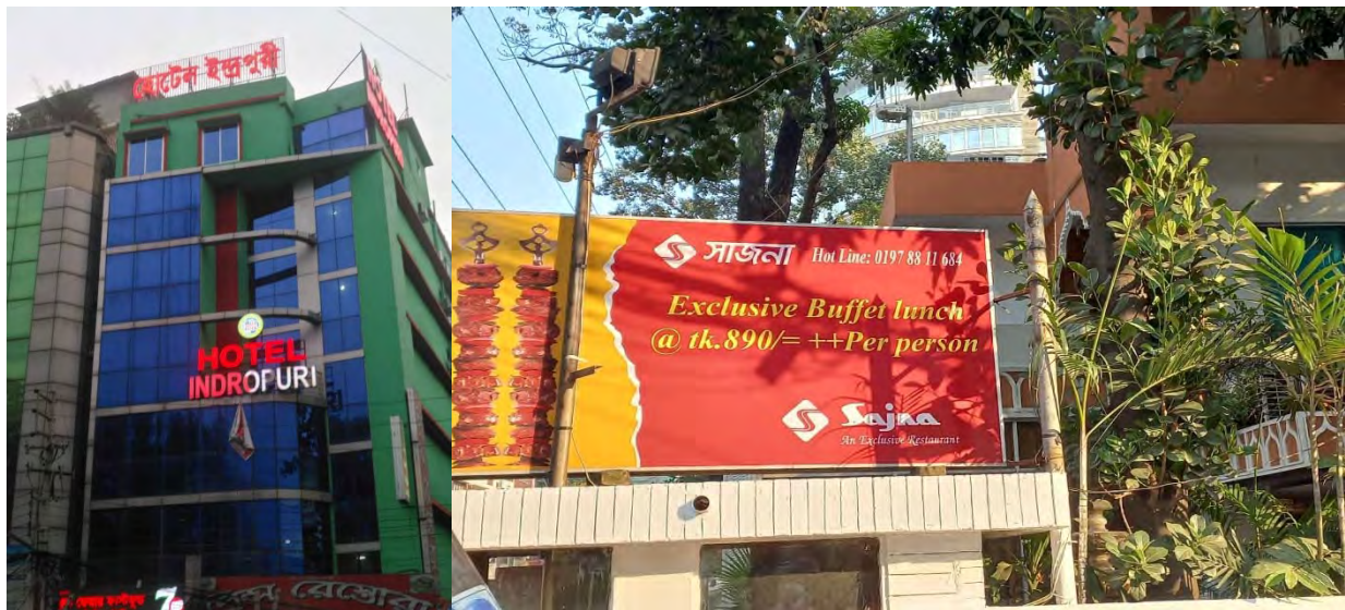
Figure 6- Language Mixing and Language Hybridization