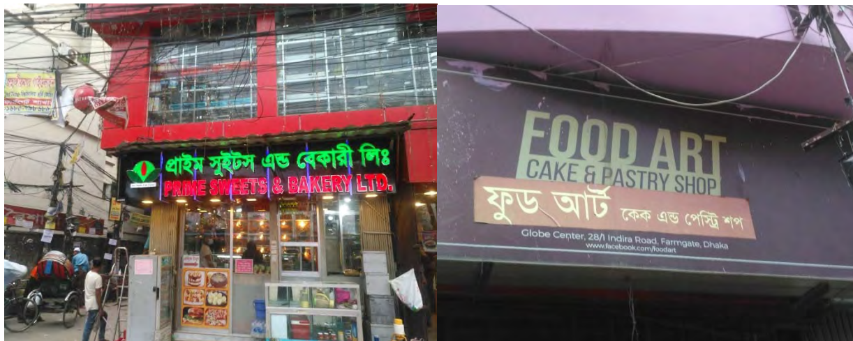
Figure 8 - English and English transliterated into Bangla

14% of the collected samples show the presence of English language and English transliterated into Bangla. Transliteration is the process of writing words using letters/alphabets of a different language. It is the process of replacing words/meanings with words/meanings of another language as sometimes there might be a shortage of exact equivalent in the language resource to convey the same meaning (Regmi et al., 2010). Figure (8-10) are some examples of English and English transliterated into Bangla on Dhaka city's linguistic landscape.