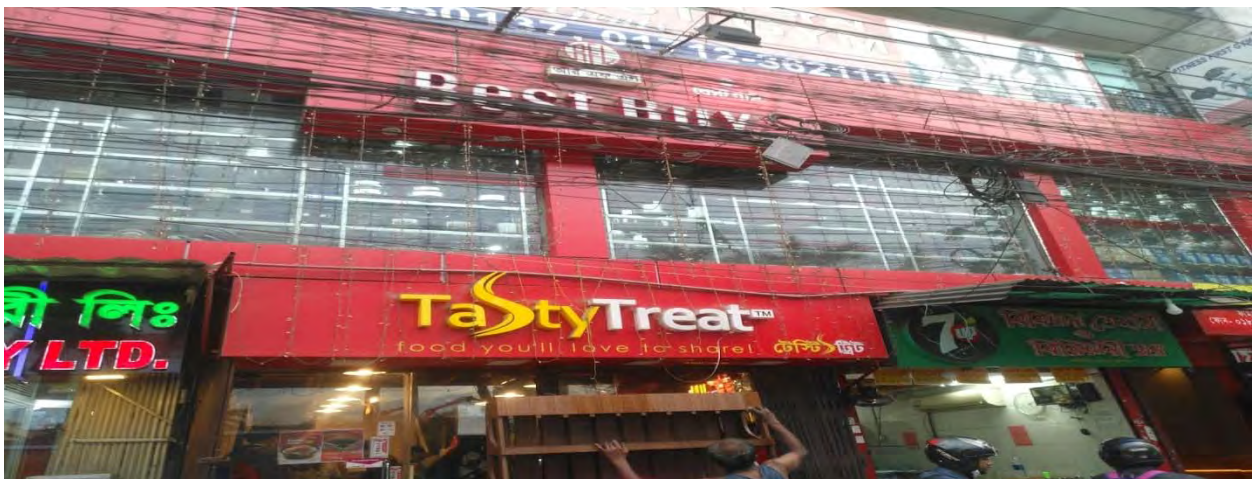
Figure 10- English and English transliterated into Bangla

In figure 8, on the left-side signboard, 'Prime sweets and bakery LTD' is a complete English name, on the signboard at its right side, 'Food Art' is also completely an English name. Bangla word resource do have equivalent words for 'food', 'art', 'sweet', 'shop', 'cake' which are chronologically, 'khabar/khaddo', 'shilpo', 'mishti', 'dokan', 'pitha', yet the advertisers chose to transliterate the English words using Bangla letters. 'KFC' (figure 9) is a widely known brand in the world which sells fried chicken and is apparently seen in Dhaka, Bangladesh now. However, they are not a franchise of it. It is understandable that, there is no equivalent meaning or word in Bangla word resource which could replace 'KFC' other than transliterating it but in figure-10, 'Tasty Treat' could be replaced by equivalent Bangla word or meanings, yet its Bangla name is transliterated and written in a lot shorter size than the English one in 3D English letters. There is also a message written in 'English', "food you will love to share".