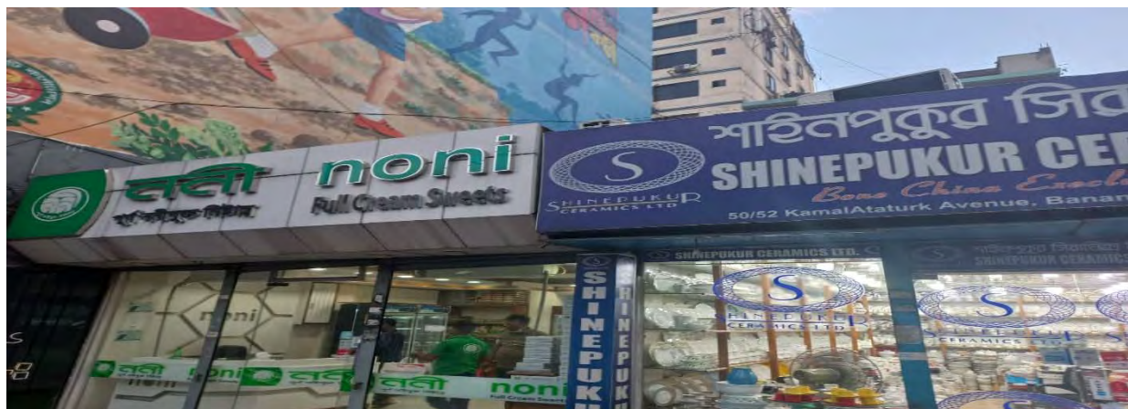
Figure 7- Language Mixing and Language Hybridization

In Figure 6, ‘Hotel Indropuri ’, both the Bangla and English names are in 3D format and in electrically lit letters. Additionally, the signboard on its right, the price tag and type of the lunch they offer are all in English, but the shop name, ‘Sajna’ is at first written in Bangla on the left