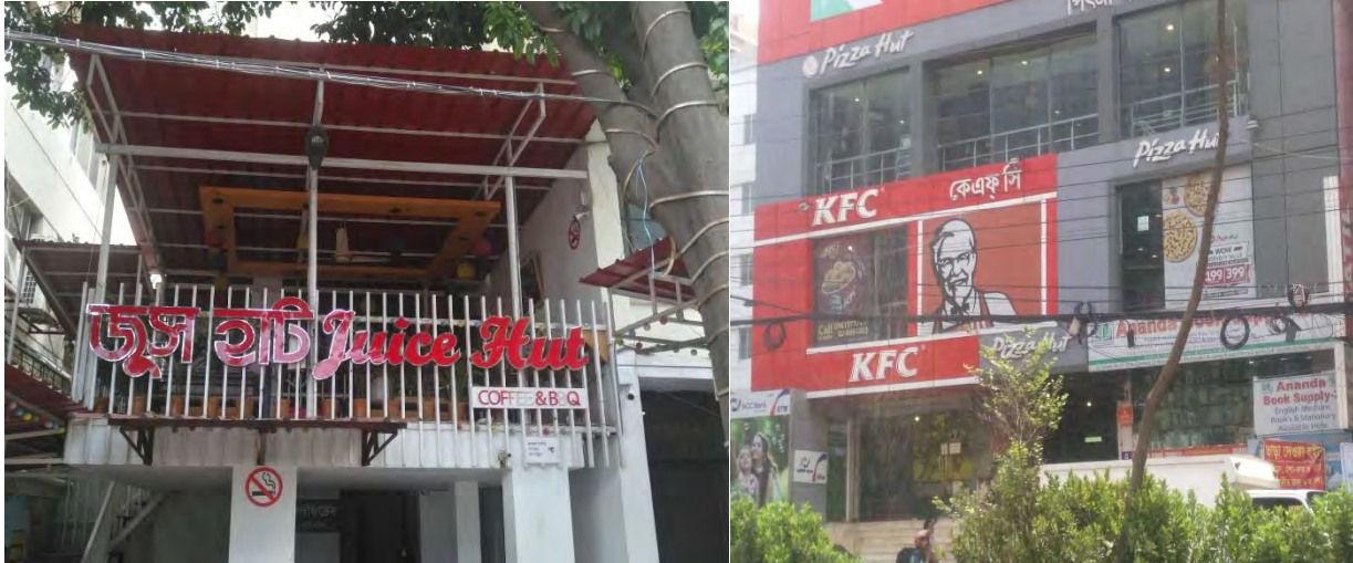
Figure 9- English and English transliterated into Bangla