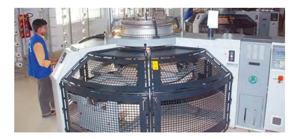
Fig 2.2 Circular knitting machine