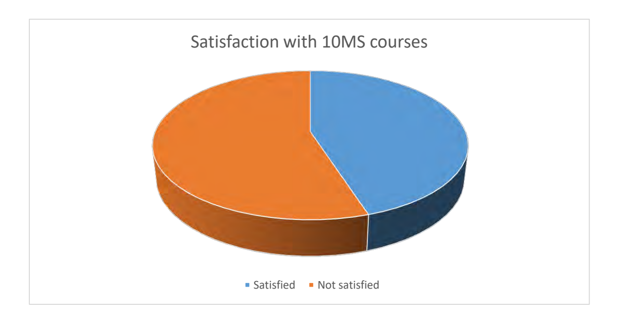
Figure 2: Satisfaction with 10MS courses

55% of the participants were not satisfied with their courses. Participant 15 mentioned it to be a 'waste of money and waste of time'. 6 participants added that they did not learn much from it as it was basic and not advanced enough. Participant 12 narrated that only people are excellent at self-studying might get help from this but those who prefer an extra hand would not get much help. Almost all the participants agreed that the courses only gives surface level knowledge to the learners. They also mentioned that they were given some practice tests but those were very limited and easy.