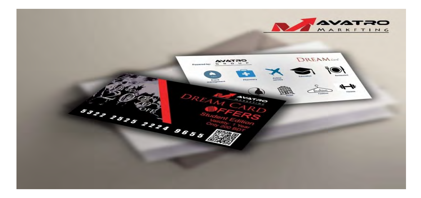
Fig: Dream Card

Being enlightened and passionate about the technological blessings and thinking about the next booming e-commerce sites, it embraced the light of IT & Technology. Avatro IT solutions and Software farms were found to keep face with the trending and competitive world market. It made an arrangement where people can learn about IT based things like learning in a training institute and became a one stop solution platform where people can demand for most of their technological queries and products. Avatro One Stop IT Solution is a complete solution provider of software development, computer networking and end-to-end communication services. The products are as follows-