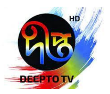
Figure 06 : Kazi Media (Deepto TV)

Deepto TV is a satellite and cable television channel broadcasting in Bangladesh. It is owned and run by Kazi Media Limited, a subsidiary of the Kazi Farms Limited. It officially began broadcasting on November 18, 2015, and within two weeks had become Bangladesh's most watched television channel. The office is in Tejgaon. Kazi Media's Deepto TV has become extremely popular around the whole country because of broadcasting the turkish tv series in bangla. Deepto TV is vastly involved in showcasing shows about social problems and agriculture.