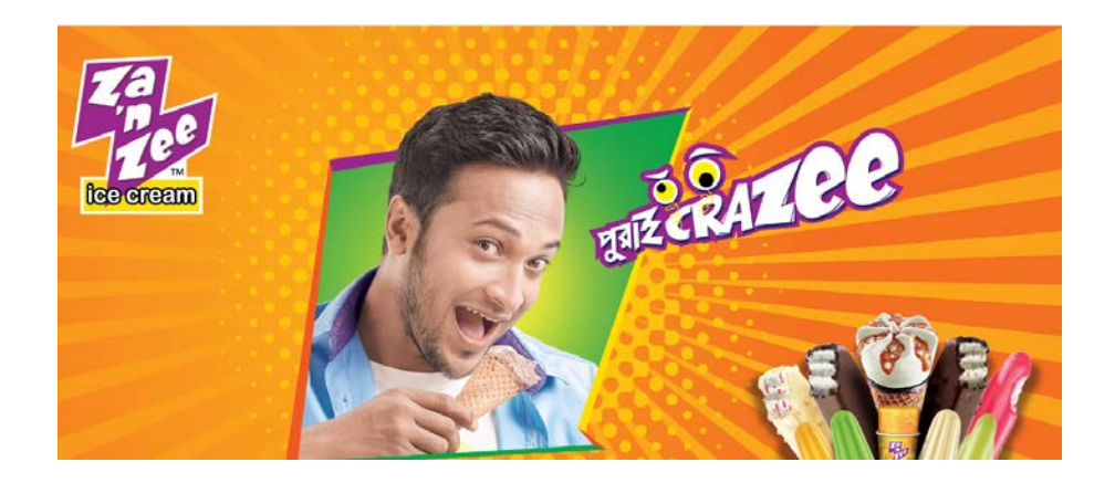
Figure 08 : ZaNZee Ice Cream

comparatively a little cheaper than the rest of the brands in the market. The main office for all the Kazi foods is at Shimanto Shombhar at Dhanmondi 02.