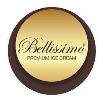
Figure 09 : Bellissimo Premium Ice Cream

• Bellissimo Ice Cream : Bellissimo is the bigger brand of ice cream by Kazi Foods. This has the more premium options and flavors available. The factory is situated in Ashulia. The chain restaurants and fine dining restaurants also use Bellissimo ice cream for their restaurants. All products of Bellissimo contain 10% of milk fat as per international standards.