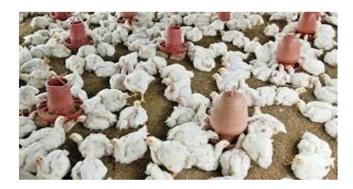
Figure 03 : Parent chicks and Broiler chicks at Kazi Farms CBF

KKazi Farms Limited is the Grand-Parent franchisee for Avigen Indian River and Cobb-Vantress, two of the world's greatest broiler breeds. Kazi Farms Limited broiler chicks are the best performing in the domestic market and are more expensive than other broiler breeds.