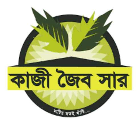
Figure 05 : Kazi Organic fertilizer