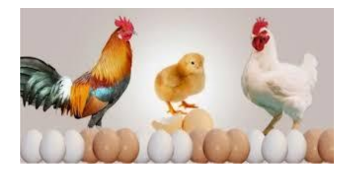
Figure 04 : Layer chicks & Table eggs