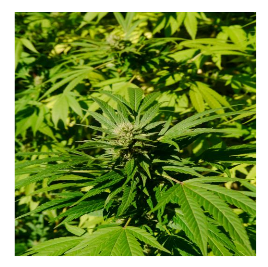
Figure 1 : Cannabis Sativa

• <u>Cannabis sativa</u>: Cannabis sativa, or a sativa strain, is characterised by a tall, lean body and narrow leaves. Originating in the tropics, they are known for their energising and inspiring qualities. Higher concentrations of THC (tetrahydrocannabinol), the psychoactive ingredient responsible for the "high" associated with cannabis usage, are characteristic of sativa strains. Sativas are known to have a more cerebral and stimulating effect, elevating mood and encouraging mental clarity, concentration, and social interaction. People who want more energy and a better mood may find them helpful to take during the day (Hillig, June 2004).