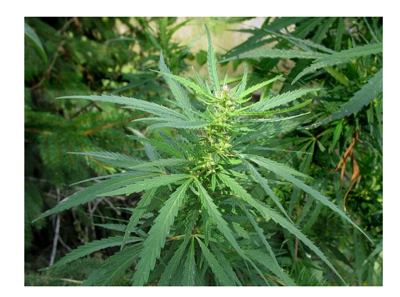
Figure 3 : Ruderali