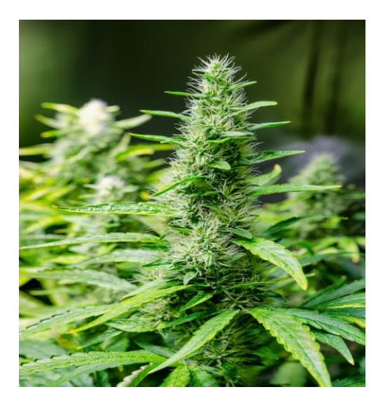
Figure 2 : Cannabis Indica

Sativa strains. It is theorised that they came from the Hindu Kush mountains in the Indian subcontinent. Higher concentrations of CBD (cannabidiol) and other non-psychoactive cannabinoids in indica strains are responsible for its calming and sedative effects. Indicas are commonly used for their "body high," which includes sedation, pain relief, and increased relaxation. In order to relax, relieve stress, or help one fall asleep, they are typically used in the evening or at night (al, 2011).