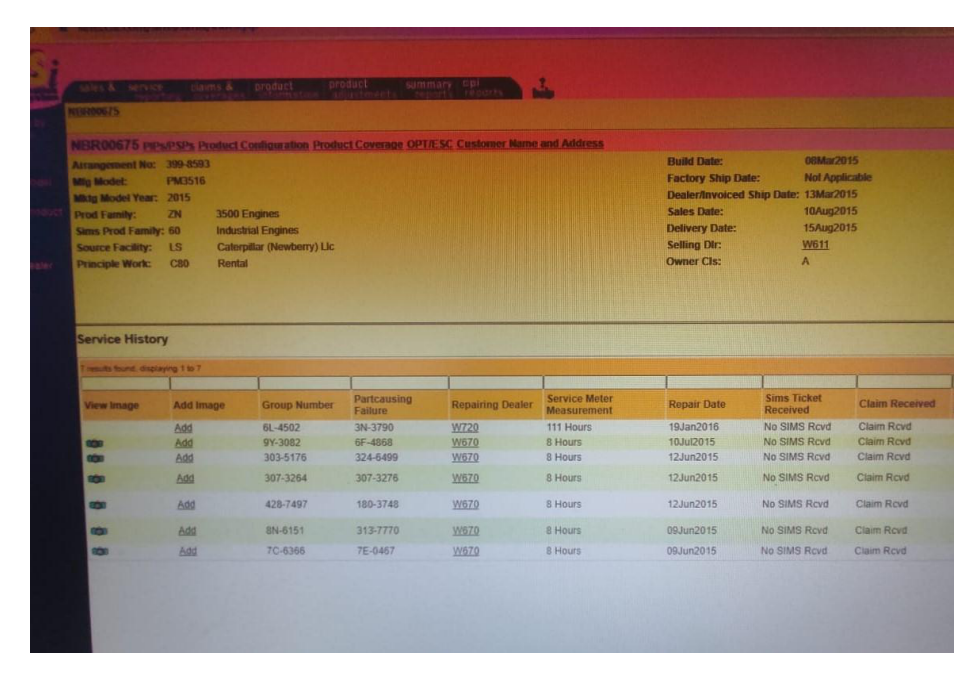
Figure 4.2: Equipment Data Input

In BanglaCat, this organization has own sites where they store the information. My responsibility is to input the engines serial number and update the Mfg year, principle work, (what is the type of engine) and add equipment id in CAT site.