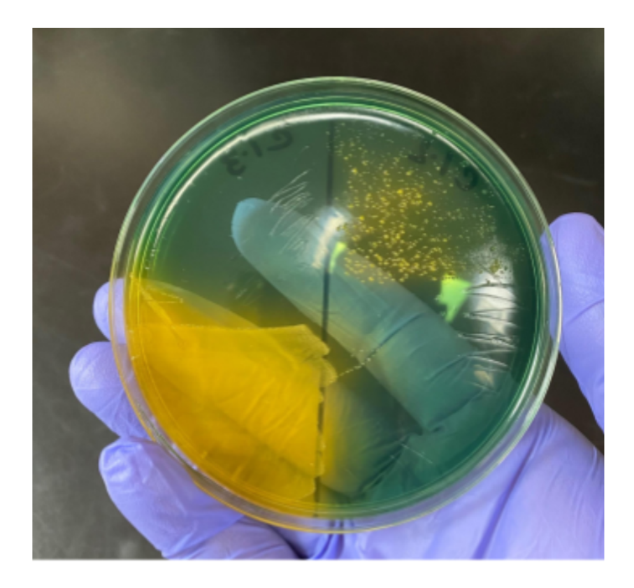
Figure 1. Vibrio cholerae on TCBS agar; Yellow colonies are Vibrio cholerae and Greenish colonies are other Vibrio spp.