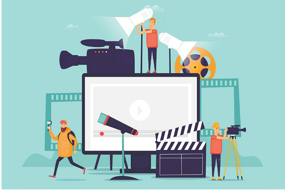
Fig 1: Media and Entertainment Industry (Forbes India)