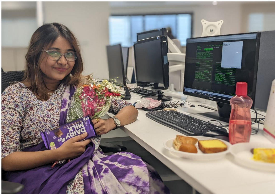
Figure 4: Women's day gifts