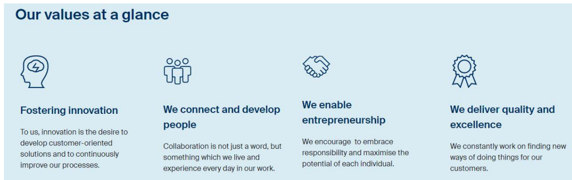
Figure 8: Core Values of Kuehne + Nagel Limited