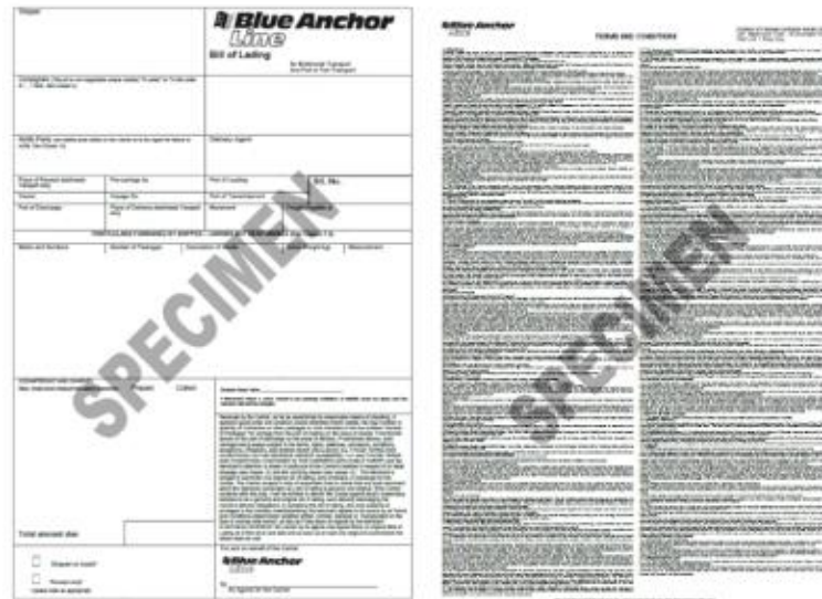
Figure 10: Bill of Lading (B/L) Specimen

Step 6: After vessel sails Bill of lading is issued by KUEHNE+NAGEL. This is one of the most important documents. It is the document where all the information about shipper, consignee, product details, and container details are given. The shippers come to the office to collect the B/L document and submit it to the consignee (bank). The Bank then gives them the money for the goods they exported to the overseas. The entire documentation of the Bill of lading is done in CIEL by the Operational care unit (OCC) of the sea freight department.