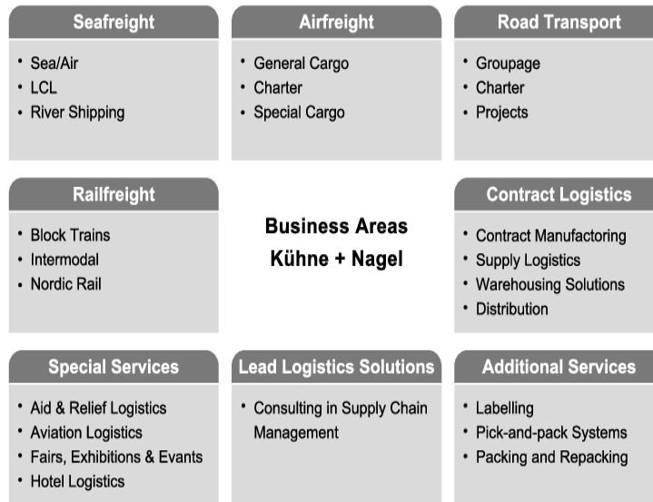
Figure 6: Operating Segments of Kuehne + Nagel Limited