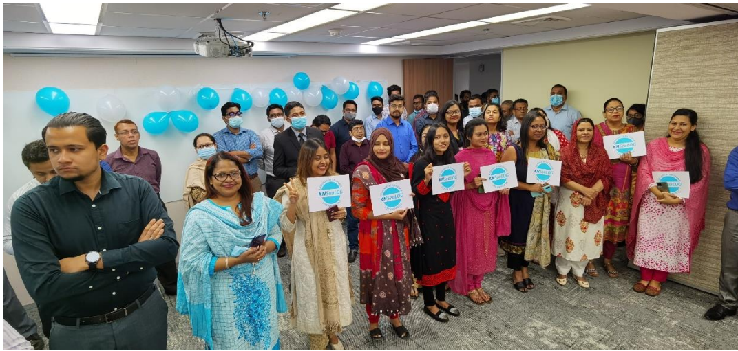
Figure 1: SALOG Implementation event

Even if my contributions were not very broad in this short period of time, I believe with these contributions Kuehne + Nagel Bangladesh Limited has shaped me up in building professional skills that will help me in my future endeavors.