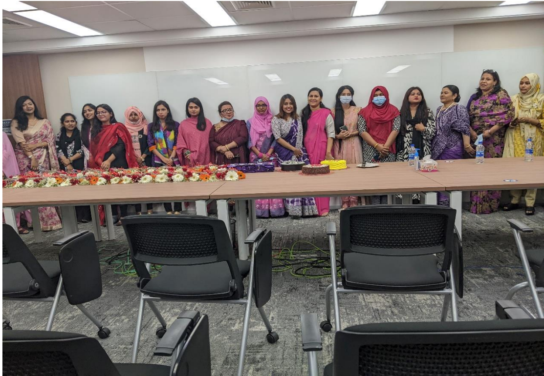
Figure 3: Women's day celebration