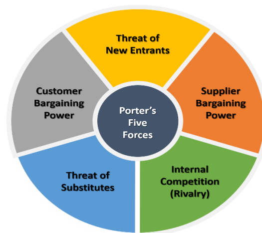
Figure 11: Porter's Five Forces