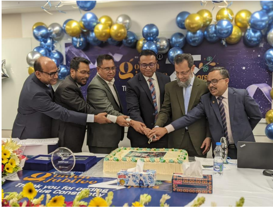
Figure 5: 25 years of Kuehne + Nagel Bangladesh Limited