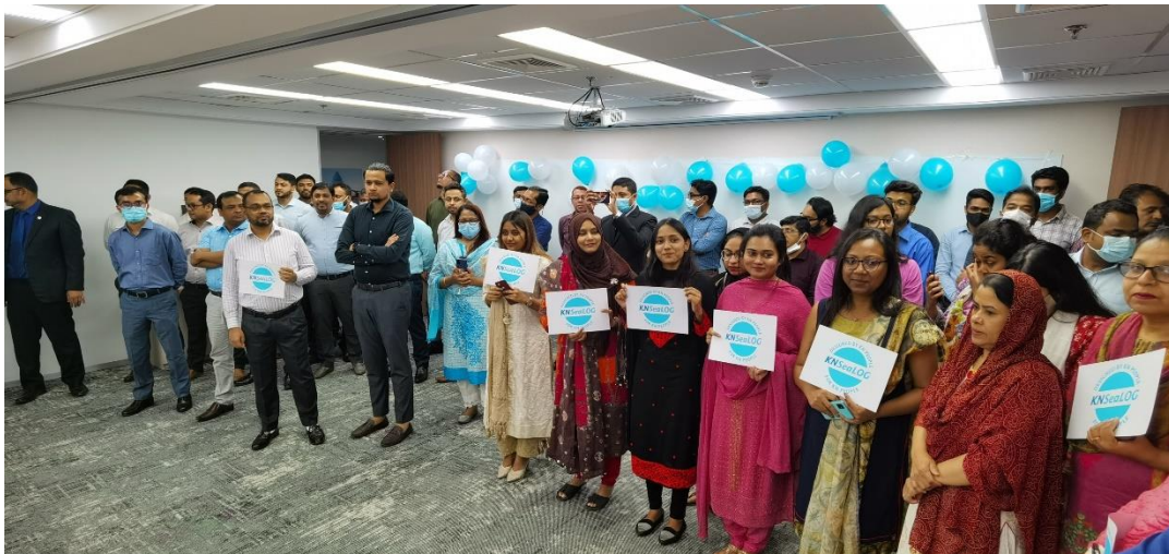
Figure 2: SALOG Implementation event