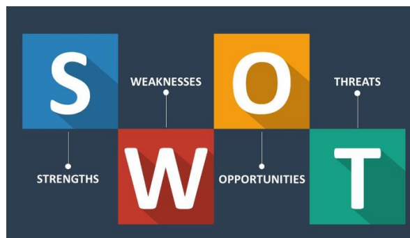
Figure 11: SWOT Analysis

SWOT analysis is the framework that is used to evaluate a company's competitive position and to develop strategic planning. It has two external factors (strength and weakness) and two internal factors (opportunities and threats).