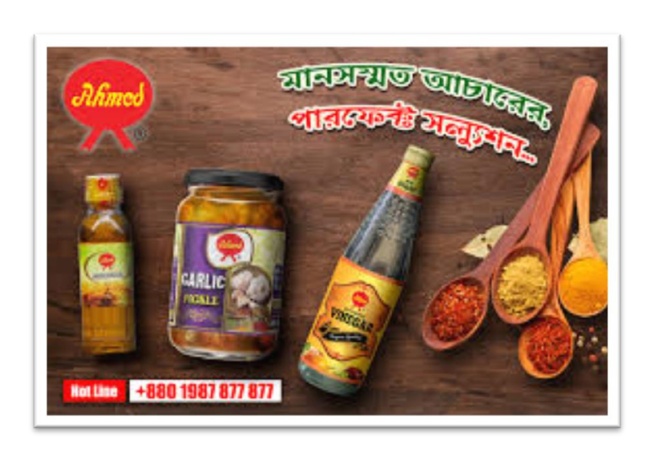
Figure 3: Ahmed Campaign Targeted towards female consumers

In the time while the TV advertising industry boomed, Ahmed Food was always quick to grab that opportunity and utilized that medium to promote its products and spread the brand message. With the changing time, Ahmed Food has also shifted its demographic of the target group. As the products became more youth-driven, Ahmed Food also stared casting young models for their commercials to attract the attention of younger consumers. The main products of Ahmed food include ketchup sauce, puffed rice, fried peas and nuts, spices, baking powder, cake, pickle, etc. Ahmed Food products have been recognized by international bodies for their impeccable quality. Since its inception about five decades ago, Ahmed food has always focused on quality and utilized the up to date mediums to promote their products.