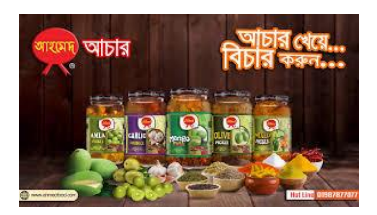
Figure 1: Marketing Campaign for Ahmed Pickle

quality products, so it also promotes the brand as the most qualified food product available in the market.