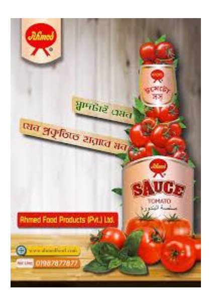
Figure 4: Interactive Ad of Ahmed Sauce

This increased competitive situation encouraged Ahmed Foods to expand its product portfolio and adapt to the changing needs and demands of the consumers. Ahmed Food has always kept its product quality intact even after facing tough competition from foreign competitors. Many local competitors were adopting the strategy for aggressive marketing rather than focusing on providing quality products. Certain local companies were investing more funds in aggressive marketing campaigns but ignoring product quality control issues. This led to a conspicuous decline in the quality of those company's products. But Ahmed Food has always maintained the balance between product quality and ample marketing campaigns. With the changing time, Ahmed food has also adapted to the evolved marketing dynamics. The marketing strategies that can be taken by Ahmed Food to strengthen its market position is given below: