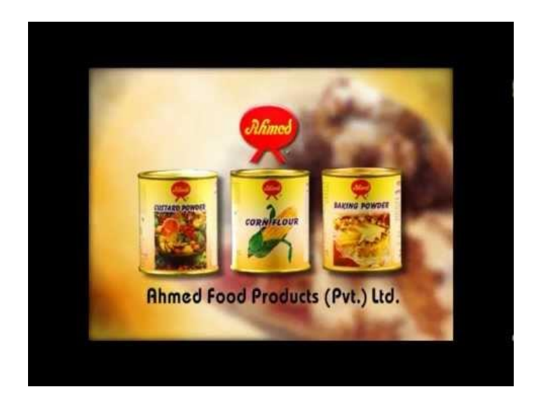
Figure 2: TV Ad for Ahmed Cornflower

The products of Ahmed food group are locally sourced, manufactured, and distributed. Due to its extraordinary quality, good taste, and sustainable packaging, Ahmed food products are also distributed in certain foreign markets.