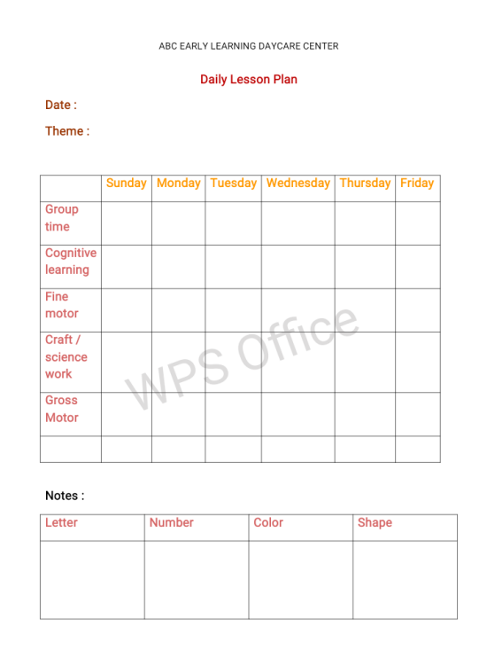
Figure 1: Daily Lesson plan sheet

The daily learning objectives are mainly focused on 5 different developments of a child. They are -