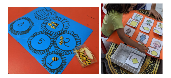
Figure 4: they learn number counting by counting bees

Preschoolers learn through theme-based study, as mentioned before. There is a theme for every week. All the studies and activities are followed by that particular theme. For example, in 'Bee week', they learn number counting by counting bees, the letter 'B' for Bee, and the science behind honey bees' honey collection method.