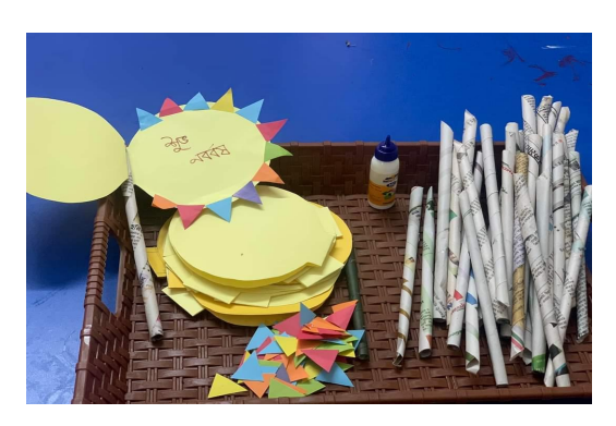
Figure 3: Preschoolers crafted cards on the day of Pahela Raishakh

Craft/science work: ABC ELDC believes that science activities improve young children's reasoning and problem solving skills. Besides, craft works enhance children's hand eye coordination along with brain productivity. Alongside occasional crafts, every week once or twice, the preschoolers of ABC do craft activities.