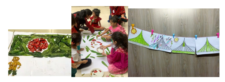
Figure 5: Children's interaction in art and artifacts on account of victory