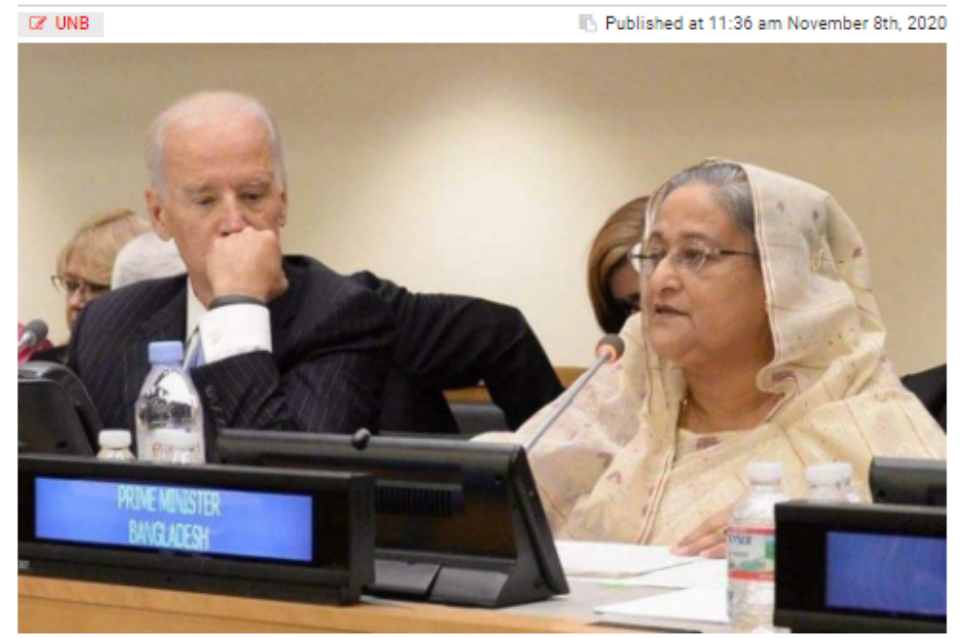
File photo: Prime Minister Sheikh Hasina sitting beside then US Vice President Joe Biden during the 69th session of the United Nations General Assembly at United Nations headquarters in New York City PMO