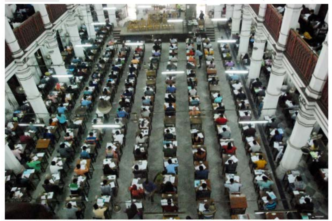
Representational photo Focus Bangla

Published at 05:56 pm December 1st, 2020