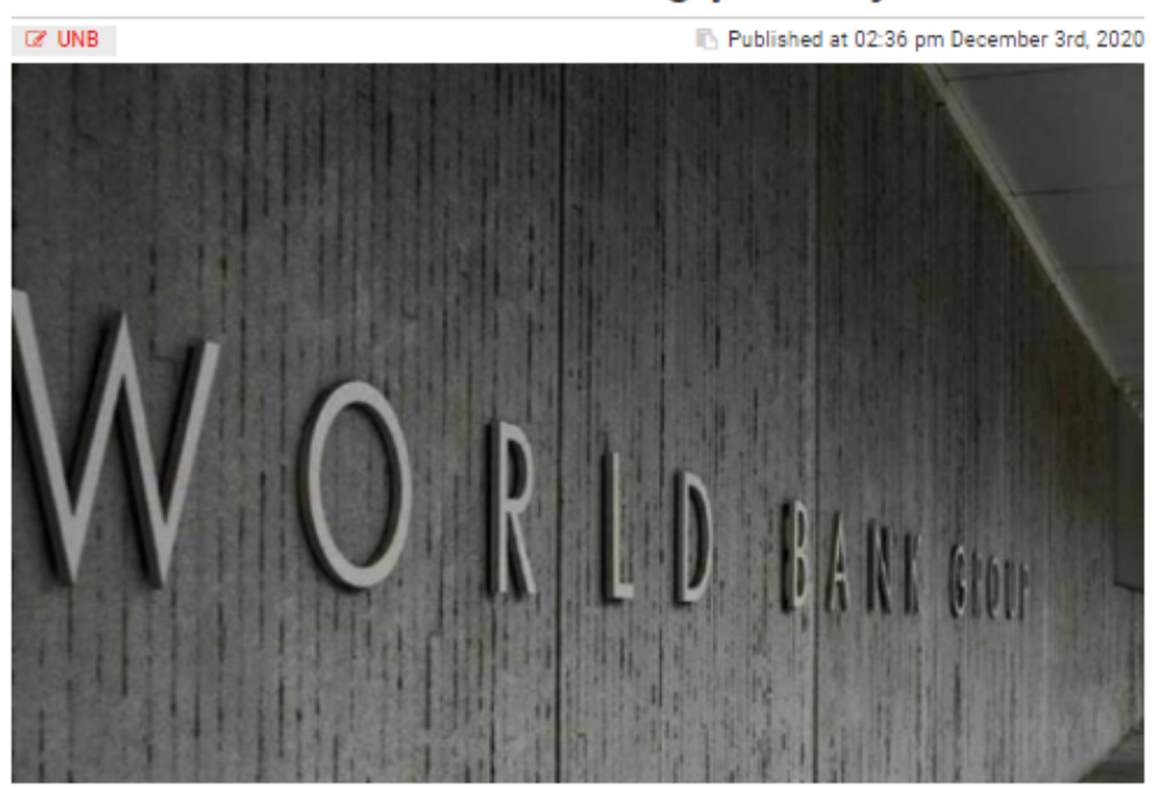
File photo of the World Bank Group logo on the building of the Washington-based global development lender in Washington DC, US

This generation of students at risk of losing about 10 trillion dollars in future lifetime earnings, an amount equivalent to almost 10% of global GDP