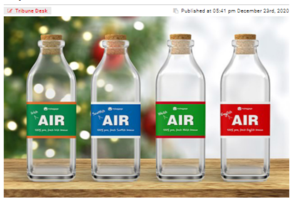
Bottles of 'fresh air' from England, Ireland, Scotland and Wales for sale for $30 each, along with 'London Underground' and 'fish and chip shop' editions My Baggage