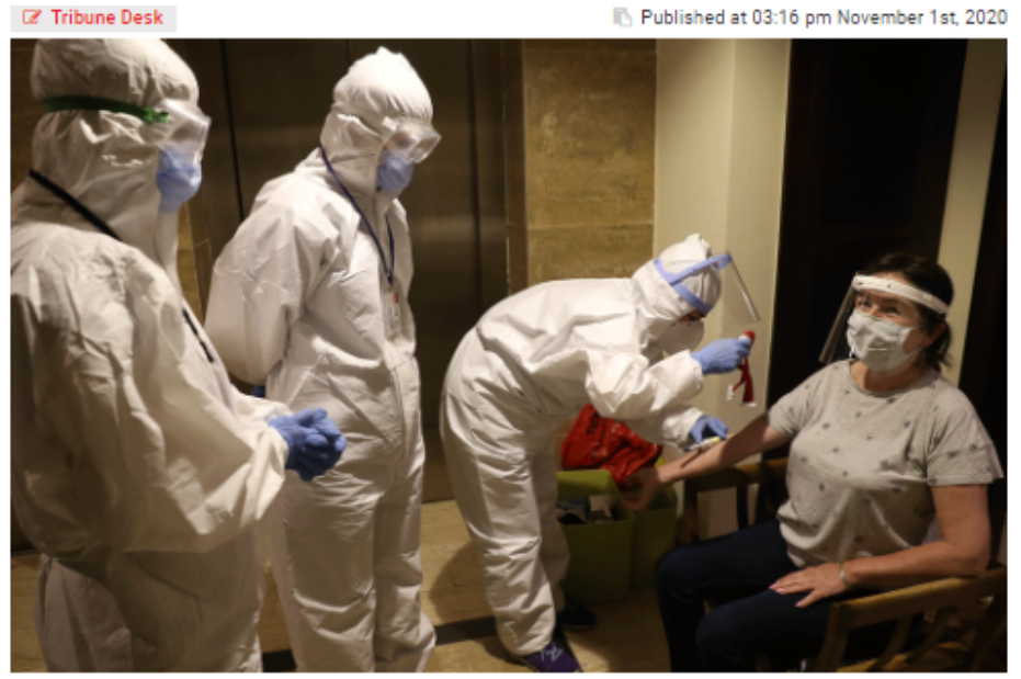
File photo: A person undergoes a Covid-19 antibody test performed by Health employees mandated by Turkish authorities, on June 15, 2020 in Ankara AFP

Experts have said these findings are not unexpected, since other viral illnesses also trigger 'autoantibodies'