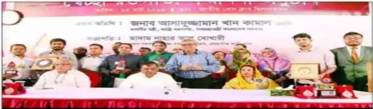
Home minister Asaduzzaman Khan attends a reception of blood donors organised by Quantum Foundation at the National Press Club in Dhaka on Friday.

The minister pointed out that if spoken Arabic is taught to the children in mosques and madrassahs across Bangladesh, it would be of great help to the job seekers who would seek employment in the Middle East in future.