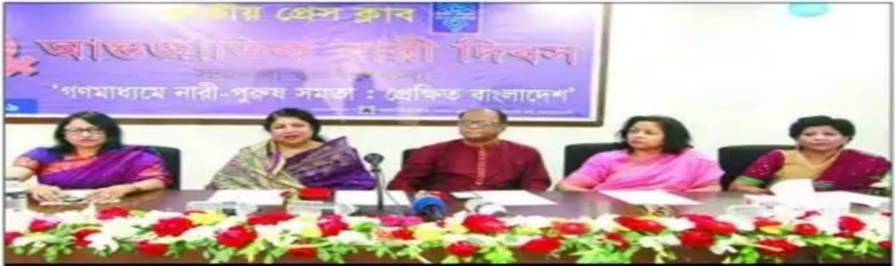
National Press Club holds a discussion on International Women's Day at the club in Dhaka on Friday.