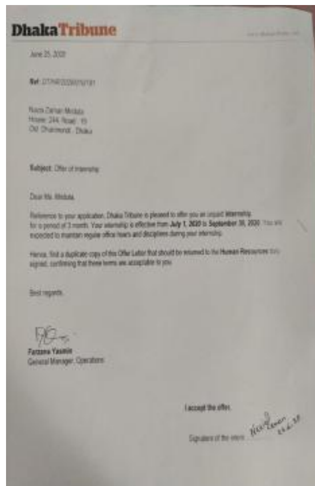
Internship acceptance from Dhaka Tribune