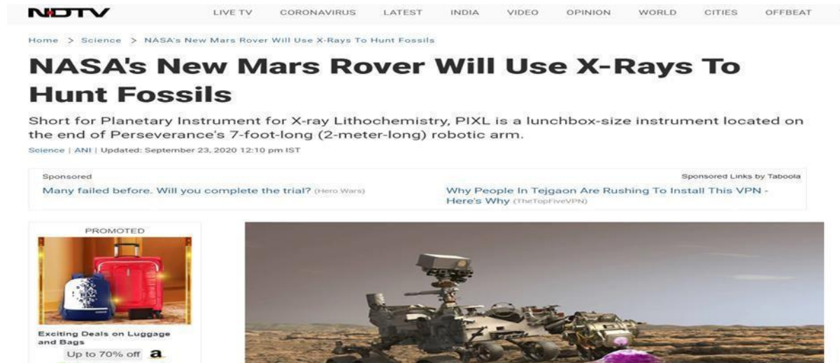
Picture of Nasa's News of NDTV

As a writer, I was given a style and guideline for changing spellings, word limit, and sometimes to minimize news for reader's better understandings. A scientific story was released about NASA's rover 2020. It was NDTV who created the story piece. Since Dhaka Tribune is a paid NDTV subscriber. We took this news from their site and re-write the news- story according to our own policy. We did our own study on the Red Planet.