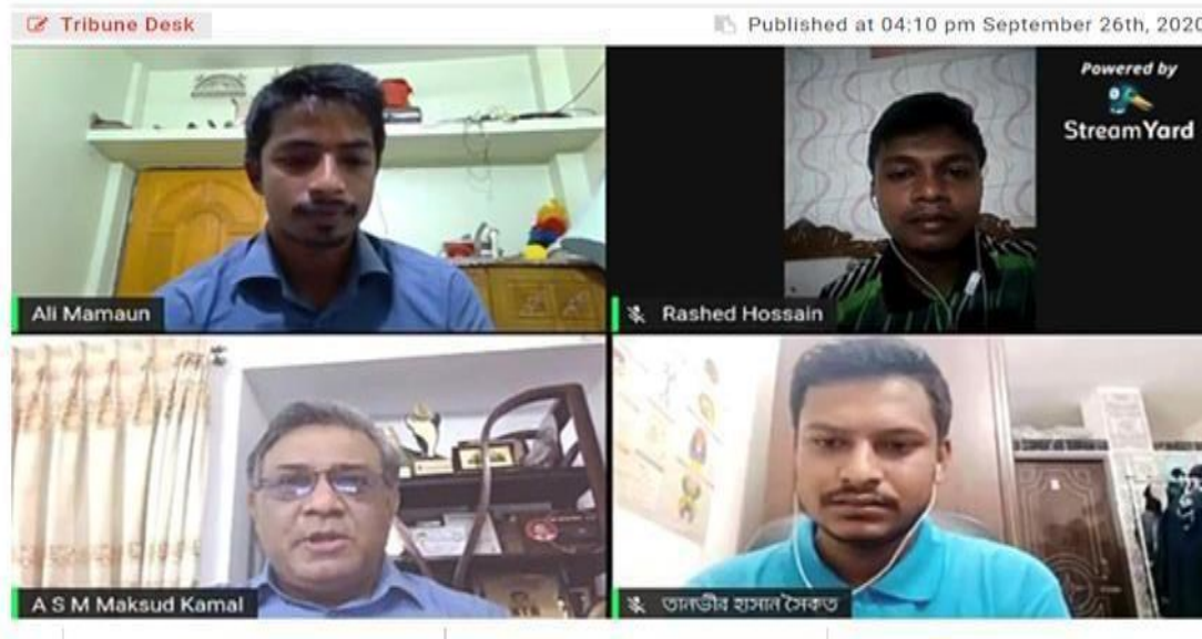
Screenshot of a website launch event

While watching any event I kept in mind what was the event topic, who are responsible for the event. What are the participants are talking about? Before joining any event, I did additional research about facts of the companies and personals related to the event.