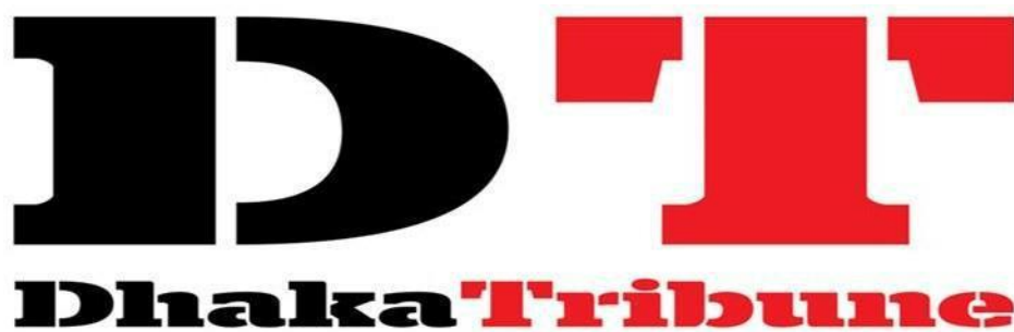
Logo of Dhaka Tribune