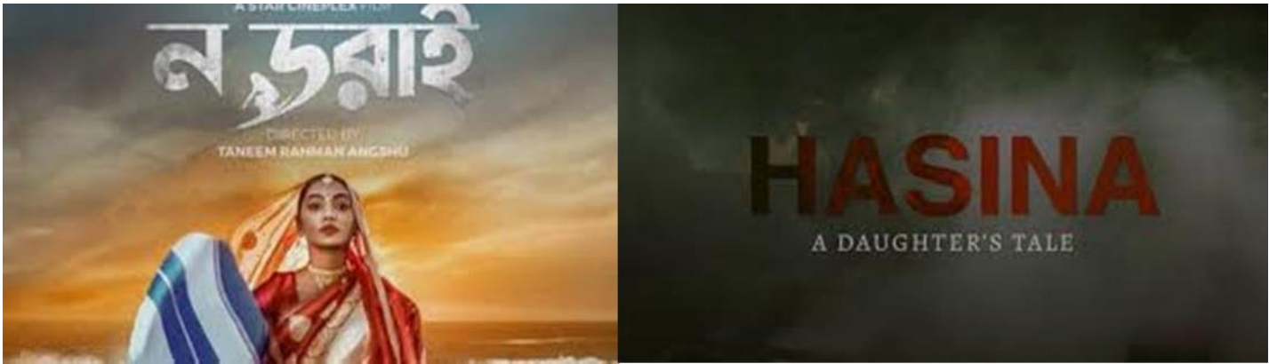
Figure:1 Movie posters of two movies na dorai & Hasina

short stories, poetry, etc. Some of their renowned works are reviewing 'eleven Bangla' moves related to women's empowerment like Noo Dorai, Sandcity, Hasina- a daughter's tale, etc. Besides "Made in Bangladesh" won several international awards. And this movie has been reviewed and promoted by the Dhaka Tribune .