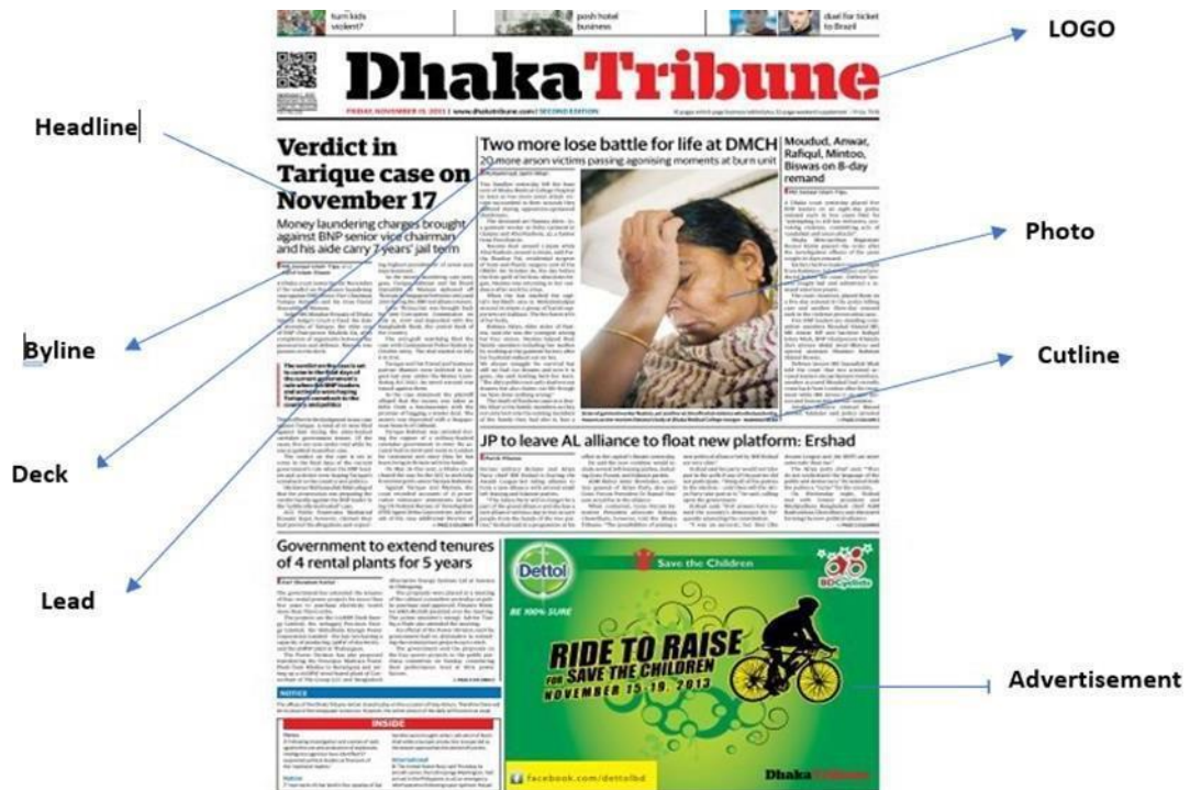
Different parts of a page

International news, entertainment news, editorial news, op-ed, etc. Main portions of front page contain Logo of the newspaper, photos, cutline, Headline, byline, deck, lead, photo, advertisements of products.