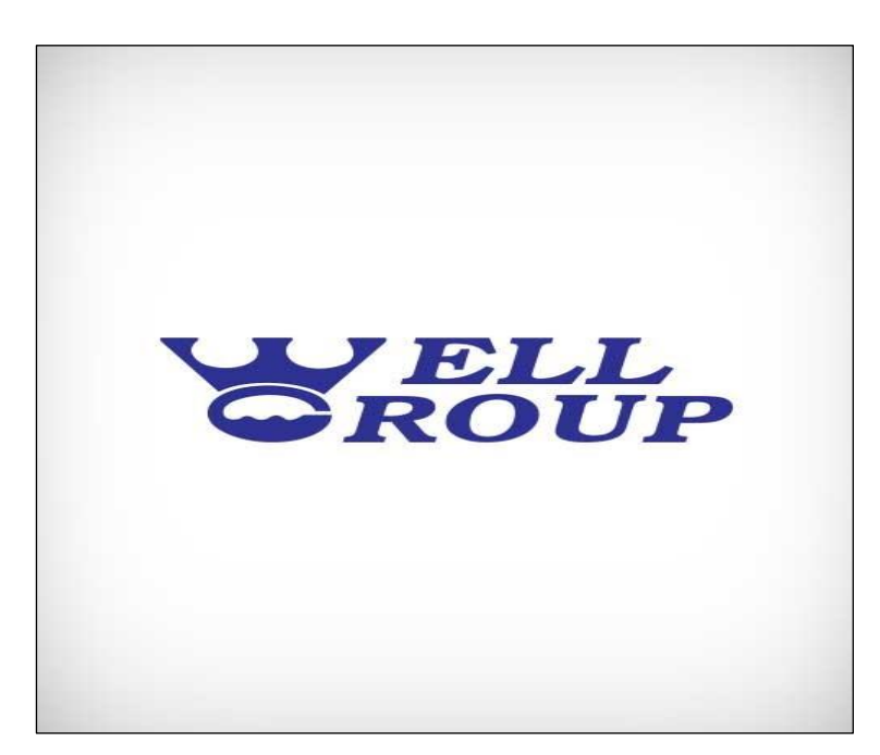
Chapter-2: Abstract, Operations & Strategic Audit of this Organization