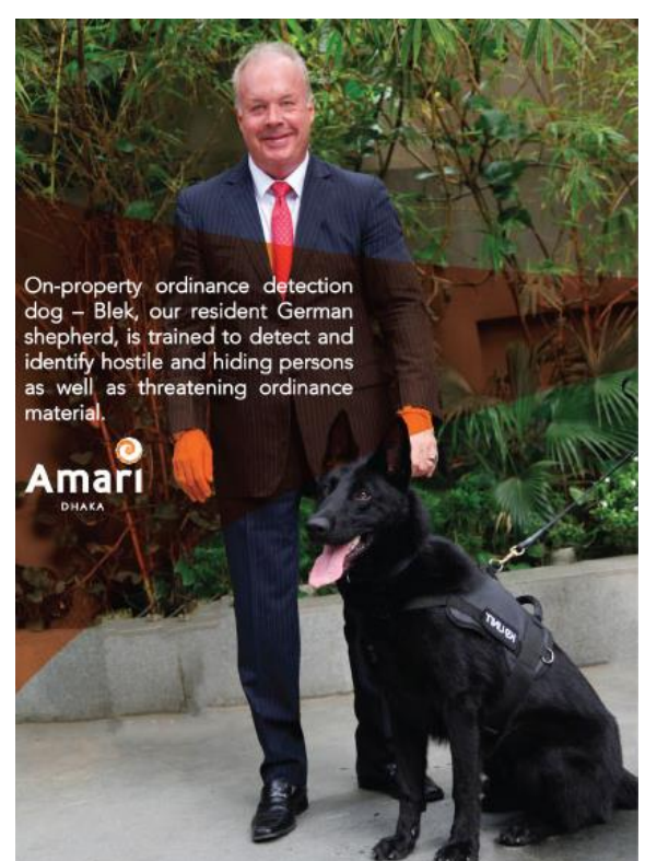
Appendix 1.2 Blek