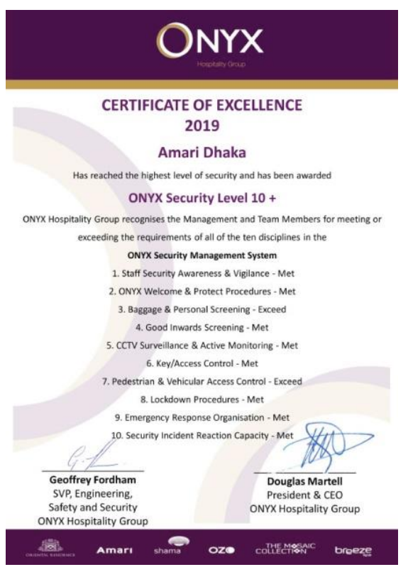
Appendix 1.1 ONYX Certificate