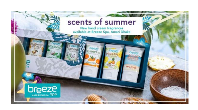
Figure: 4.1 – Hand Scrub Promotion

With Breeze Spa, other than special occasions like Christmas, the ongoing offers are on Breeze Spa products such as Hand Cream and Scrub.