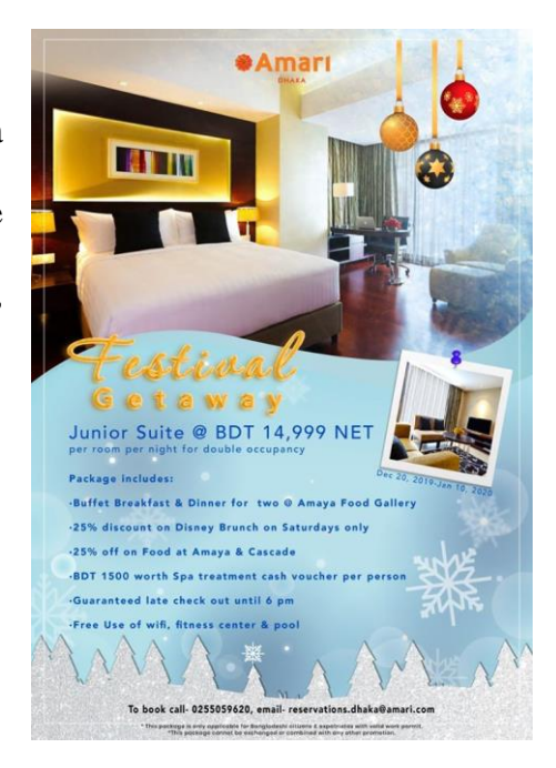
Figure 4.3 Christmas Room Package Promotion

Room Packages usually run for a few months, before a new promotion is added, and most room packages are promoted during special occasions, i.e., Eid, Christmas, etc.