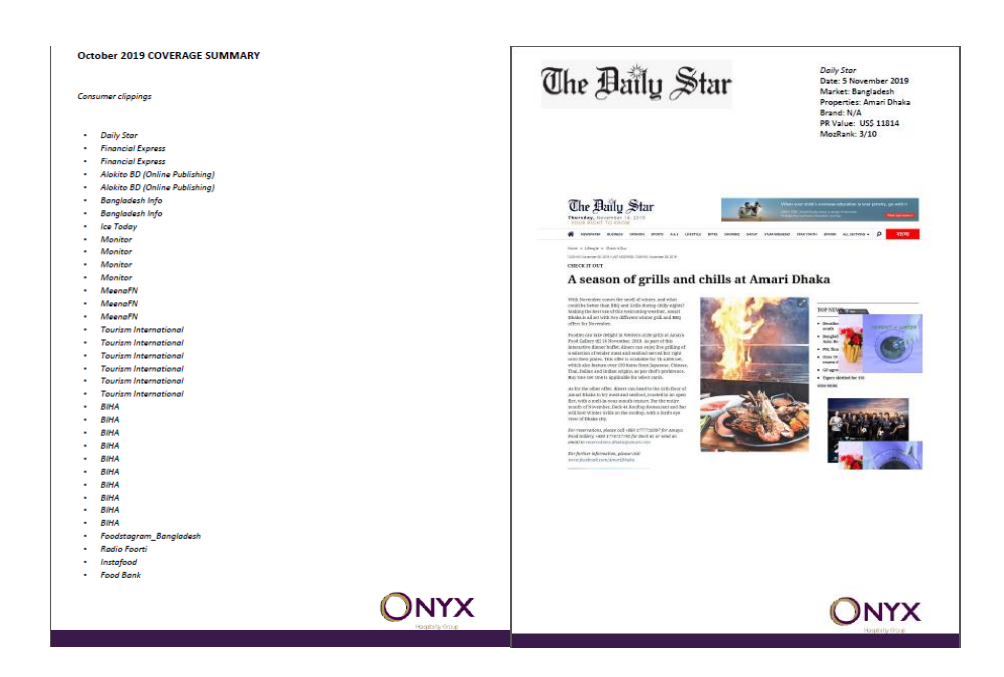
PR\ Report-Presentation\ Slides