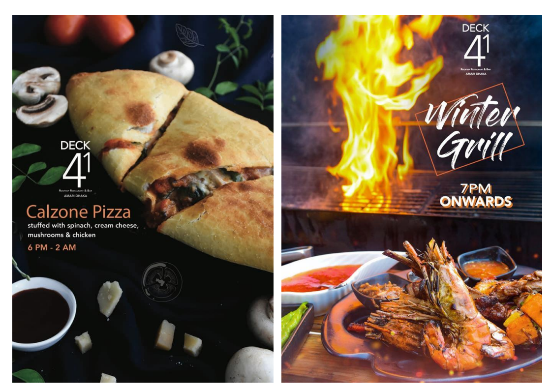
Figure 4.5: Deck 41 Promotions

Cascade provides a more casual experience with light food and coffee or tea. Every month, a special Cascade promotional dish is put on offer.