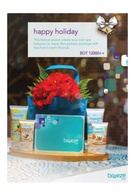
Figure: 4.2 – Christmas Package