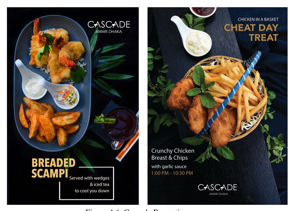
Figure 4.6: Cascade Promotions

Cascade provides a more casual experience with light food and coffee or tea. Every month, a special Cascade promotional dish is put on offer.