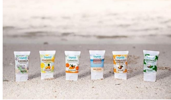
Figure 4.8 : Facebook Post Example