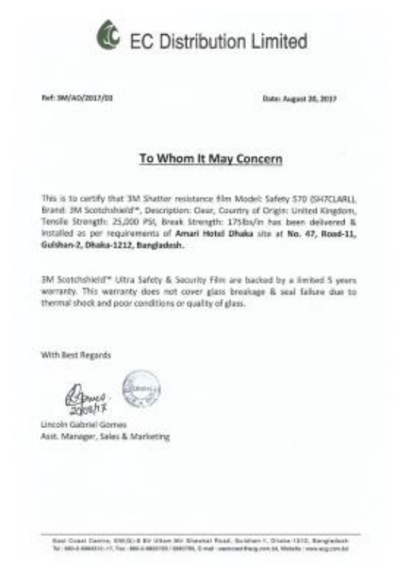
Appendix 1.3 Anti-Blast Certificate