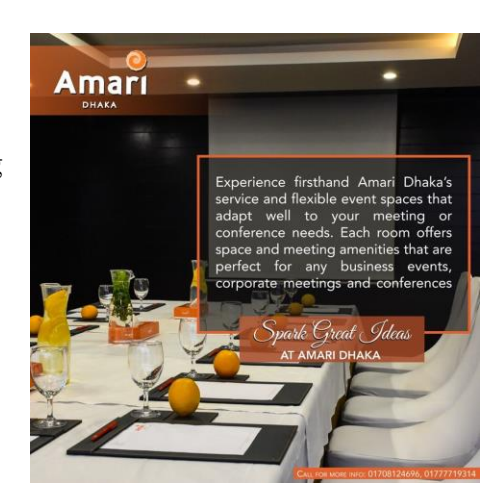
Figure 4.4 Meeting Package

For Banquet Sales, Amari Dhaka develops wedding packages, and event packages with a choice of menus.