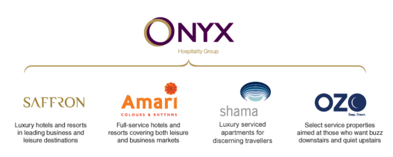
Figure 1.1: ONYX Brands

With industry experience of over 45 years, ONYX Hospitality Group is now one of Asia- Pacific's leading hospitality management companies, which has a portfolio of over 33 operational properties all over Asia and many new properties being swiftly developed over the coming years (ONYX Hospitality Group).