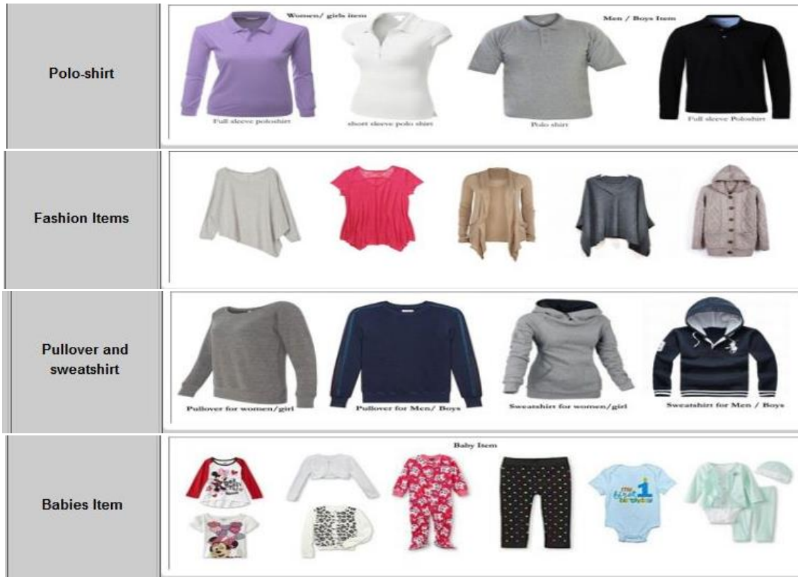
Confidence Knitwear Ltd. Products

The product line of Confidence Knitwear in given below: