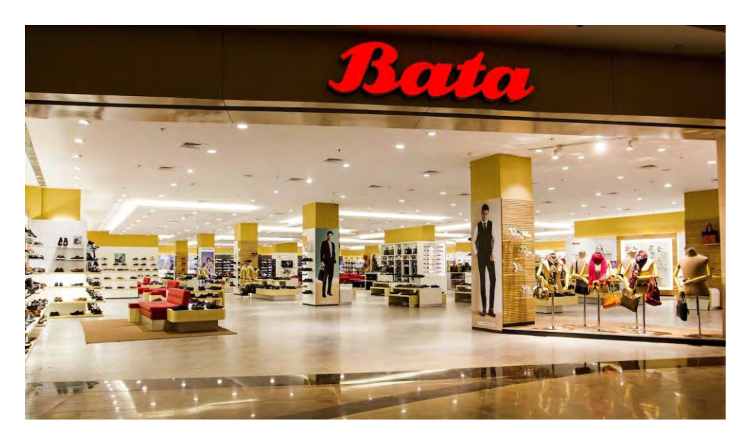
Fig. Bata New Store at Gulshan-2

second highest expenditures incurred for new retail stores. This shows how much Bata emphasizes on visual merchandising and store improvement. With every new product lines and stock, merchandisers change the outlook of the shelves and make it a new experience every time for customers.