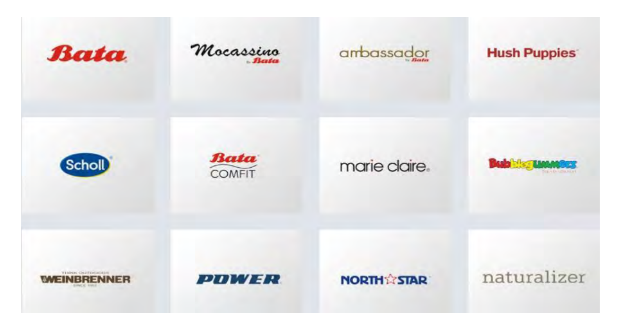
Fig. Brands of Bata Bangladesh

Bata Bangladesh has currently more than 12 brands including Bata's own merchandises. There are few brands that are locally produced in Tongi and Dhamrai plants, some are outsourced to other native vendors, but majority of the brands mentioned below are imported from South – eastern countries. The brands are segmented gender wise and priced according to various income-groups. Among the brands, Ambassador, Hush Puppies and Comfit are specially made for white collar people who seek comfortable shoes with good-looking design barring the price range. Power and North Star are the most profitable brands of Bata as they serve a wider segment of customers unlike other brands. These shoes give consumers a cozy touch along with a sporty look. Meanwhile, Marie Clarie, Scholl and Naturalizer brands are dedicated for women footwear and Bubblegummers and B-First are for school going kids. Furthermore, Bata is the sole authorized importer of merchandises of both Nike and Adidas in Bangladesh.