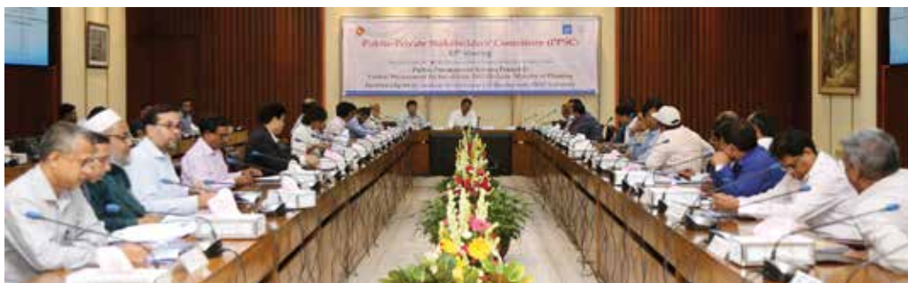
PPSC members are seen at the 12 th meeting

Illicit money and Illicit power are adversely influencing public procurement. The procuring entities are facing various challenges during implementation of projects, especially at field level. Absence of a proper monitoring system of public procurement is one of the reasons why Bangladesh cannot ensure proper implementation of projects and its quality.