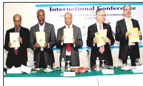
Distinguished Guests at the Inaugural Ceremony of the International Conference