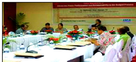
BNPS and ANSA-SAR Meeting on "Review of Institutionalisation of Civil Engagement in Development and Implementation of Budget"

bottlenecks, and ways of effective implementation of budget in Bangladesh and ways in encouraging people from every sphere to take part in the budgeting to ensure a stronger accountability in the budget formulation and implementation process. Dr. Muhiuddin Khan Alamgir, MP and Honorable Minister of Home Affairs of the