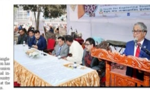
Students' union members of Dhaka University are seen at a meeting on Saturday. The meeting was held at the Dhaka University campus on Saturday.

LEFT student wing Bangladesh Chhatra Federation has demanded students' union polls at all educational institutions across the country to ensure democracy at the educational institutions.