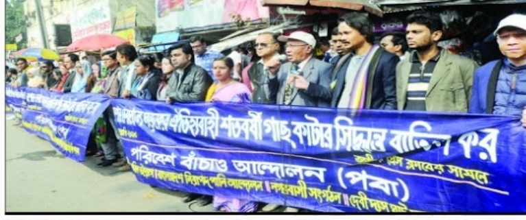
Paribesh Bachao Andolan forms a human chain, demanding protection of 100 years old trees on Jessore Road, in front of National