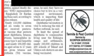
WHO, UNICEF and other health partners are working with the Ministry of Health and Family Welfare to establish fixed locations for immunisation in the Rohingya camps to continue to provide life-saving vaccines to children, in line with Bangladesh's childhood immunisation programme.