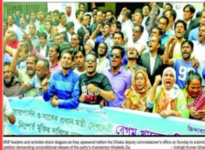
BNP leaders and activists shout slogans as they appeared before the Dhaka deputy commissioner's office on Sunday to submit a petition demanding unconditional release of the party's chairperson Khaleda Zia.