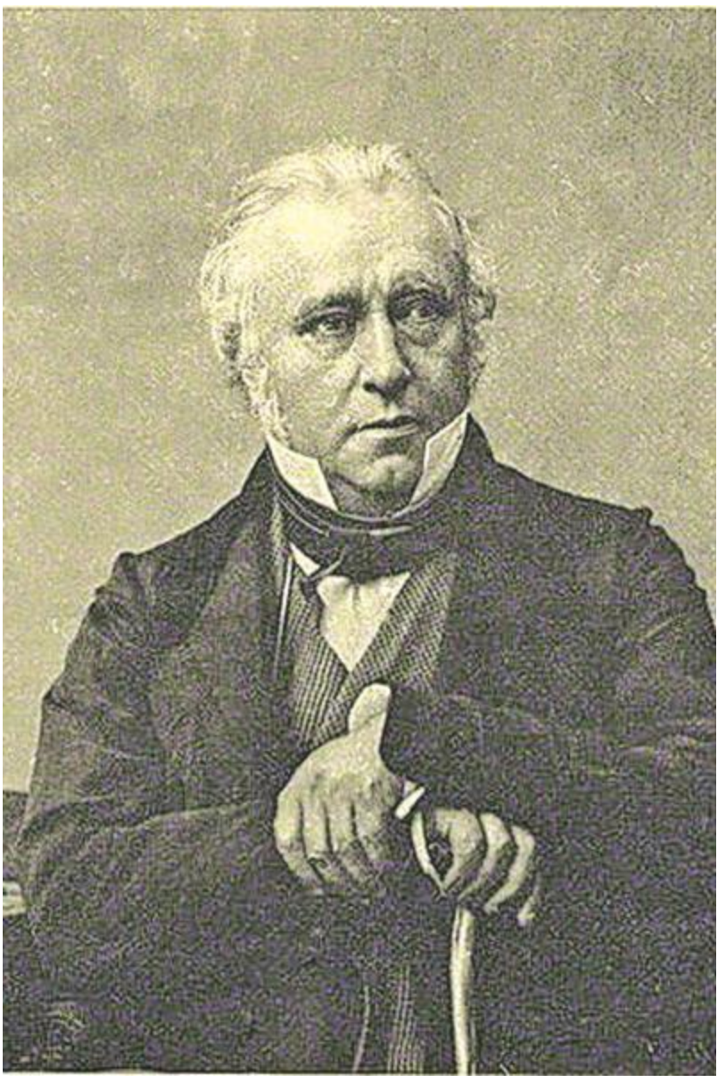
Thomas Babington, Lord Macaulay

While triggering the process of creating the new class of interpreters who were conceived as ensuring the continuity of Empire, Macaulay may have actually, unwittingly, set in motion the wheels for the ultimate disintegration of the Empire. Colonialism's rise and spread flowed, essentially from the consolidation of the European Westphalian order in the European mainland where it had originated. But the colonising process also triggered "Westphalian" awakening of identities among the ruled colonial masses that had remained dormant for long in a state of largely blissful unawareness and slumber, as well as with no sense of boundaries separating