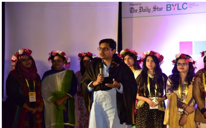
Zunaid Ahmed Palak, State minister for ICT

“I am very passionate about promoting technology especially to women because we don’t have enough women in this field. Therefore, I am working on how technology can be taken to the women.”