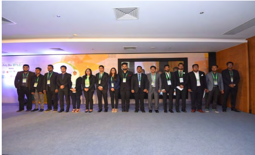
The 16 group leaders of NYA 2018

minister for ICT Zunaed Ahmed Palak's wise words. The delegates were especially grateful to NYA's leadership education partner, Bangladesh Youth Leadership Center (BYLC) for imparting knowledge on leadership as it managed to break delegates' stereotypical definition of leadership. In addition, the newly elected VBD district board was inaugurated by none other than US Ambassador to Bangladesh, Martia Stephens Bloom Bernicat. It was a moment of honor for the volunteers who got their appointment letter to serve respective district boards for a year.