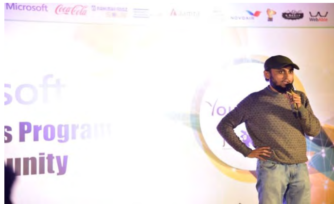
Mostofa Sarwar Farooqi, Filmmaker

Some of the highlights from the dinner are given below-