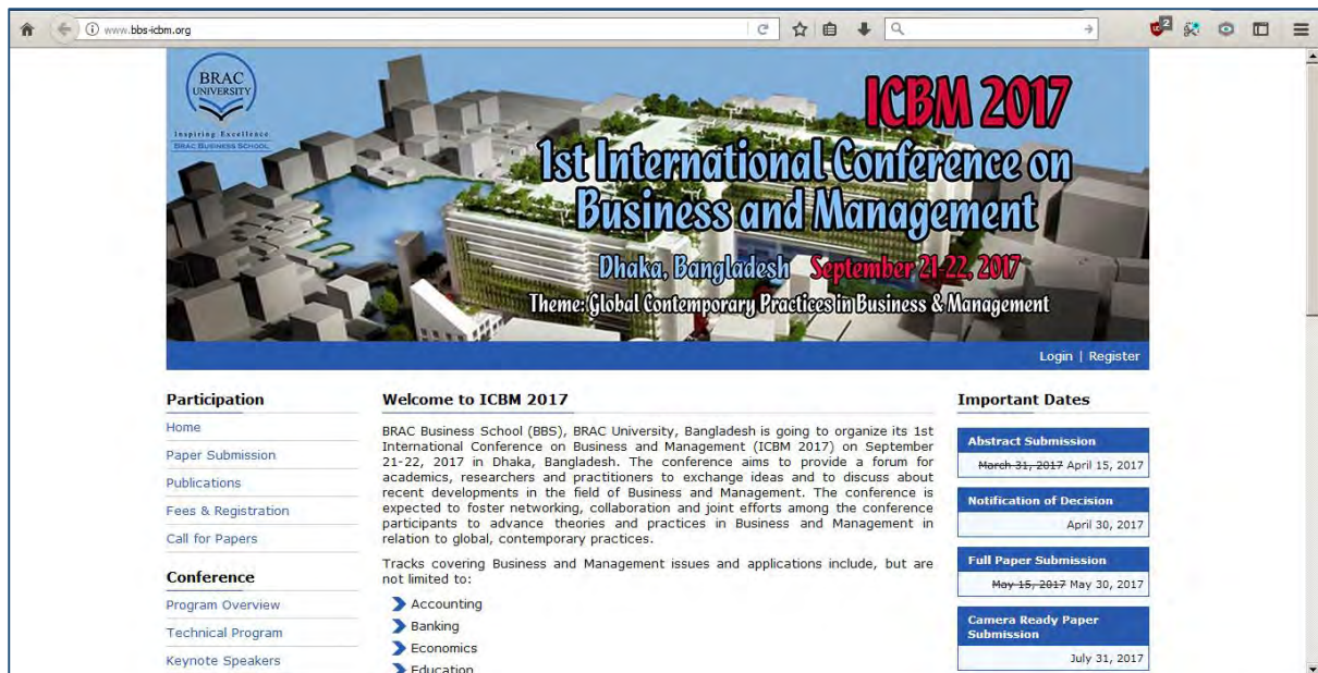
Figure: Screenshot of ICBM website

ICBM launched its own website ( http://www.bbs-icbm.org/ ) for supporting the conference participants and facilitate the registration and paper submission process. A screenshot of the website is provided below.