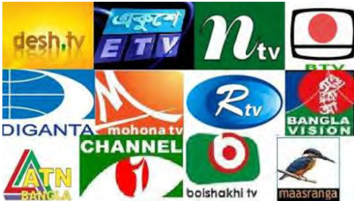
Fig 1: Different TV Channels Logo

In 2008, BRAC University's Institute of Governance Studies conducted a survey. That survey found that private TV channels' news is more reliable than Bangladesh Television. Private TV channels earned 82% credibility, whereas BTV earned only 78% credibility. This survey also revealed that ATN Bangla and Channel I are the most popular TV channels. These two channels are both program and news broadcast channels. I did my internship in the news department of ATN Bangla.