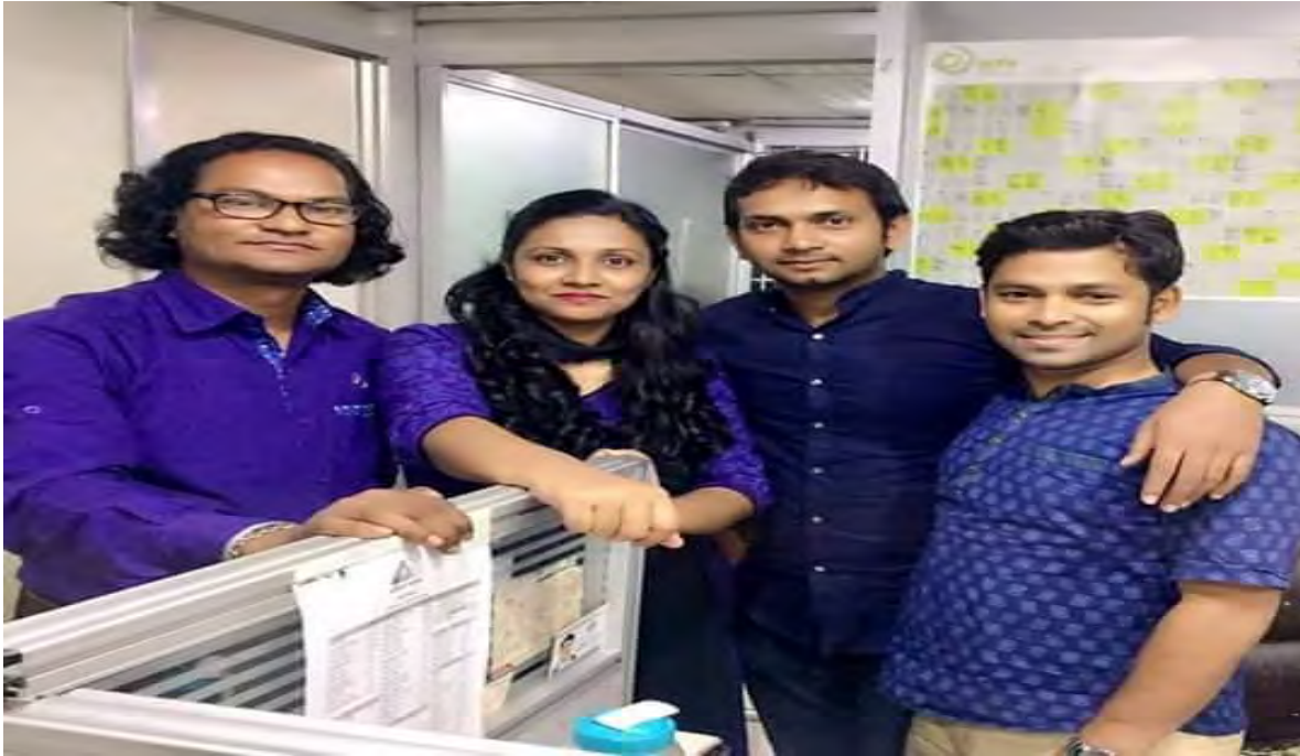
Fig 10: Sport Reporters

There are four editors and reporters in the Sports Desk. Sports news is of two types: national and international. They write reports on every kind of sports, e.g. cricket, football, hockey, table tennis, badminton, Olympic games, chess tournament etc. They visit different stadiums and, sometimes they broadcast live from the related sport venue.