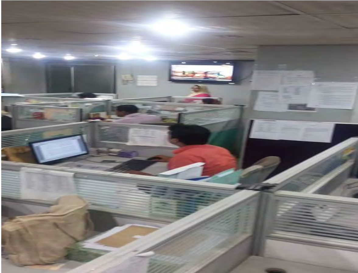
Fig 9: News Desk

events, and much more. Then, they produce news stories. It can be an item of package or OOV-Sync. It depends on the news materials.