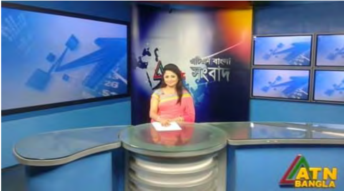
Fig 5: News Studio

The second important thing in a newsroom is the news studio. This section is under the Broadcast and Engineering Department. I gained a small experience by interning in this department. Though I did not have to do anything here, I visited the news studio and observed the work that is done there. The news studio consists of several rooms. They are: