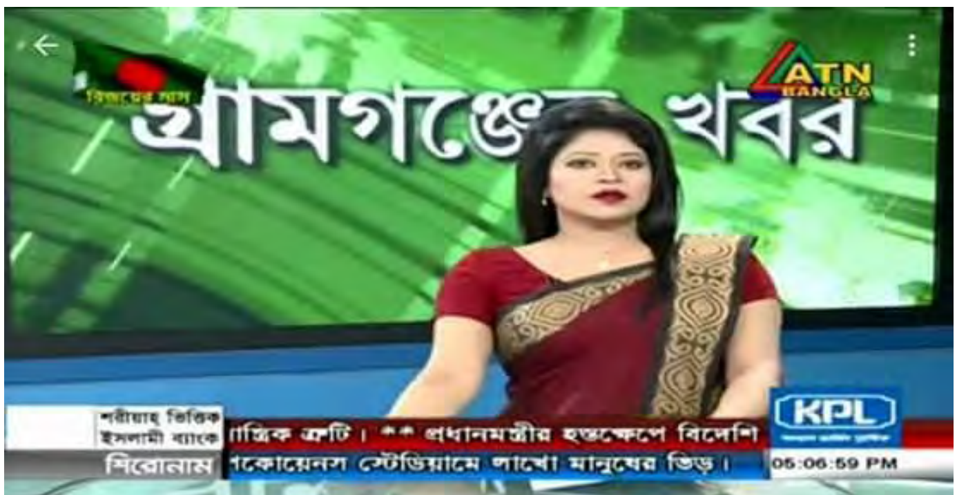
Fig 11: News Ticker

Ticker is the formal name of scroll. Scroll appears horizontally at the bottom of the TV screen. Scroll highlights up-to-the-minute news updates. Any breaking news is