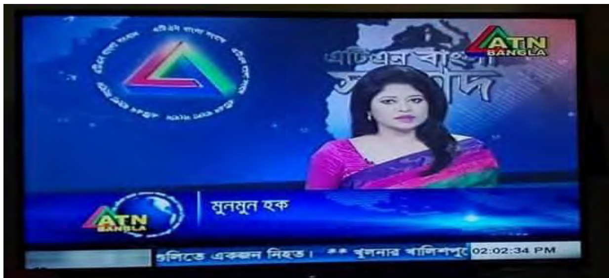
Fig 8: Aston

The Graphics room is used for graphics making. A graphics operator needs to know the graphics technology, e.g. VizRT, Aston (name and address of the reporter, presenter, guest or interviewee that is written in bold), clarity, TOG, and Chyron. S/he has to have the ability to organize information in an easy way so that the audience can understand the news. When the video footage is not available for any news, reporters try to add GFX with the story. They use the pie chart or still picture with the news story. This type of work is done by the Graphics Operator in Graphics room.