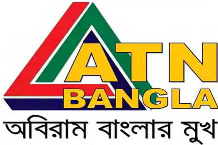
Fig 2: ATN Bangla Logo

Before digging deep into the history we first need to know what ATN Bangla stands for. ATN stands for Asian Television Network. It is the first satellite channel in Bangladesh. It stepped into its 21 st year on July 15, 2017. It has become a renowned satellite channel all over the world throughout these years. ATN Bangla has received the 32 nd International Emmy Award among all the Asian TV Channels. This channel won this award because of a children's show "আমরাওপারি"(we can). It was based on a true story of a 9 year-old-boy. This boy stopped a passenger train from approaching a disjointed railtrack and saved hundreds of passengers by preventing a train journey.