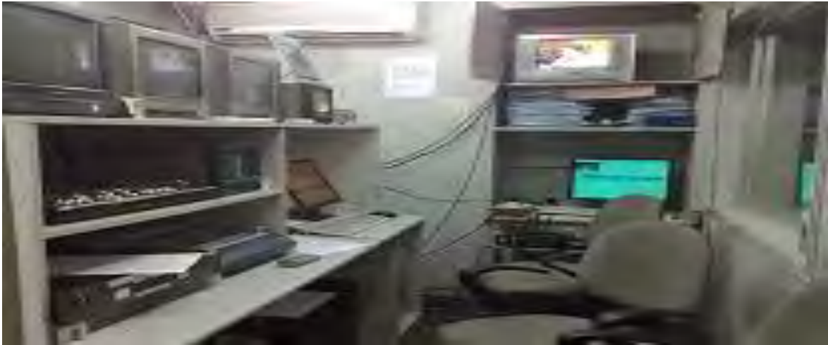
Fig 6: PCR

This room is controlled by the master control room. The news producers direct the news from this room. The every-hour news is produced by three producers (one producer and two assistant producers). During the news bulletin one manages the audio – video switcher, the other talks with the studio presenter and other one controls the whole procedure.