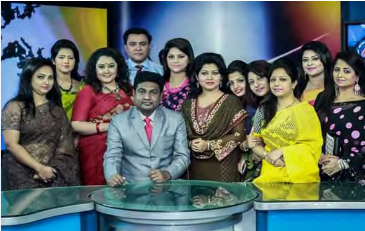
Fig 4: Presenters

News presenters are shown on television during news broadcasts. This is another form of anchoring. The presenters present news in a very organized way. They follow the producers' instructions. ATN Bangla is enriched with numbers of news presenters.