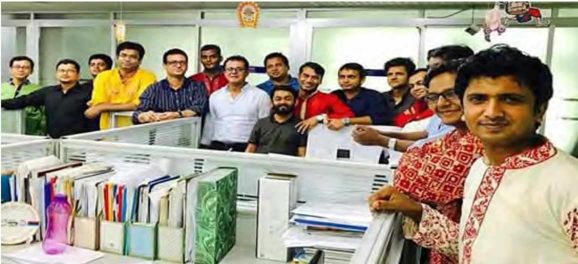
Fig 3: Reporters

Like news editors, reporters have divisions, too. Some are Chief Reporters, Senior Reporters, Junior Reporters, Desk Reporters, Business Reporters, Sports Reporters etc. Reporters cover events according to the assignments given to them and write news stories. The events can