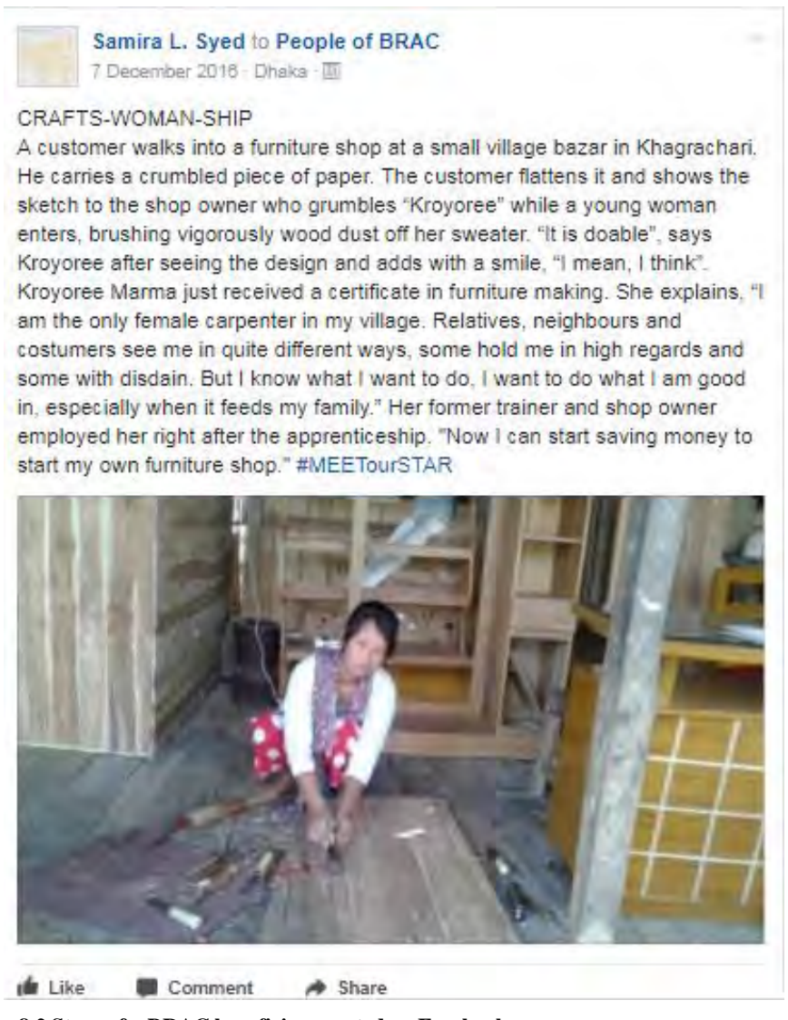
8.2 Story of a BRAC beneficiary posted on Facebook.

prepared were kept short and catchy. Moreover, along with my supervisor, I created a board on Pinterest named —Deshi Skills." The board contains some high-quality pictures of BRAC beneficiaries paving their way to success. Visual contentcan often trigger the emotion of the audience that words alone cannot. Keeping this in mind, I also created infographics with illustrators like Photoshop and InDesign. Infographics are visual images used to represent information or data. Following are a Facebook post (8.2) and an infographic (8.3) sample that I created for social media.