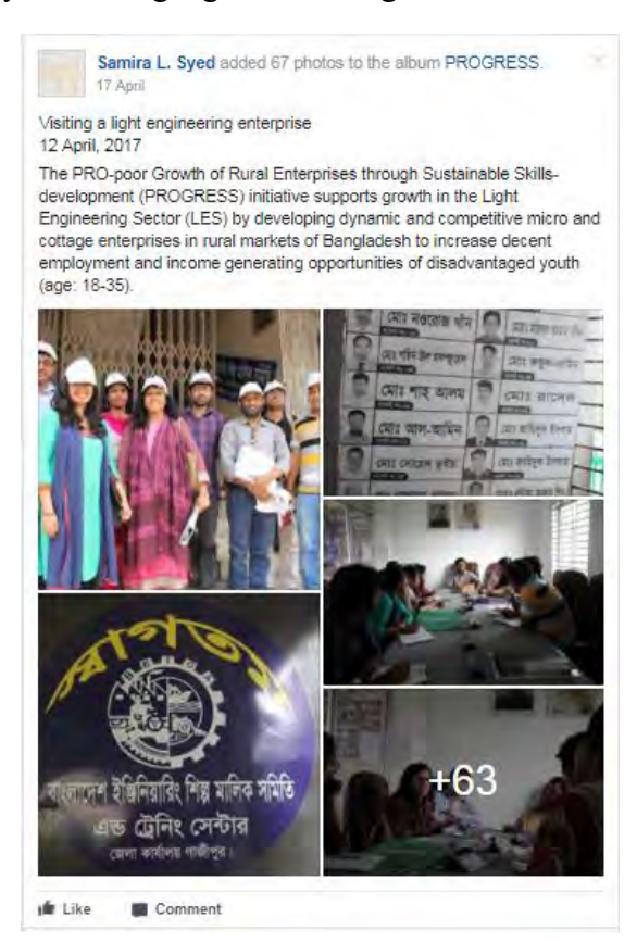
8.1 A work update on Facebook@work.

An organization's social goals should always be clear. Being the world's largest NGO, BRAC has always had a mission, and the mission highly depends on social media. The social media supports the mission in terms of community engagement, education, brand building, reputation management, program recruitment, and fundraising. To put it another way, all BRAC employees are always active on Facebook@work, this version of Facebook enables a big organization like BRAC to always stay connected. The employees can post their work related updates