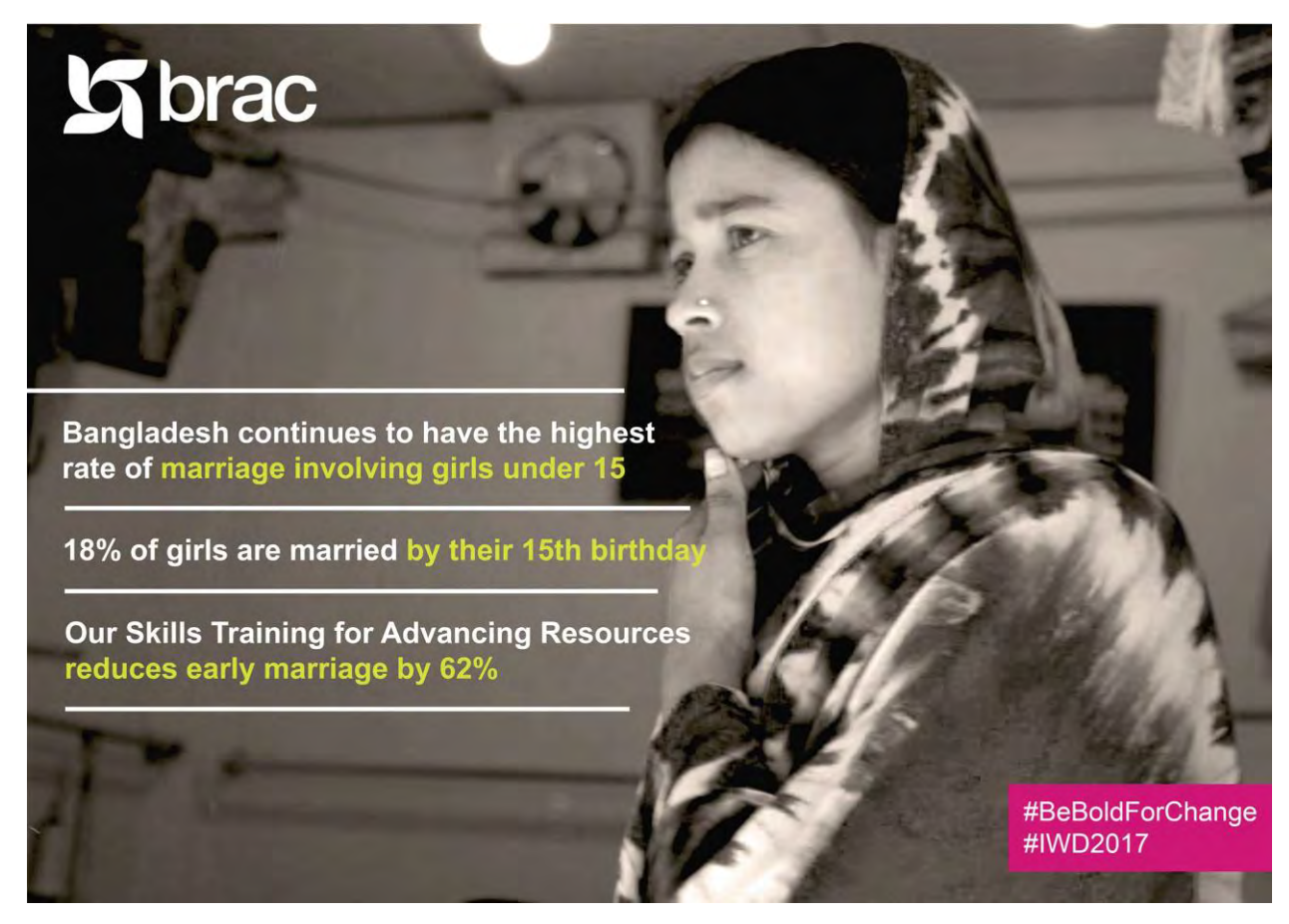
8.3 An infographic stating the current scenario of early marriage in Bangladesh.