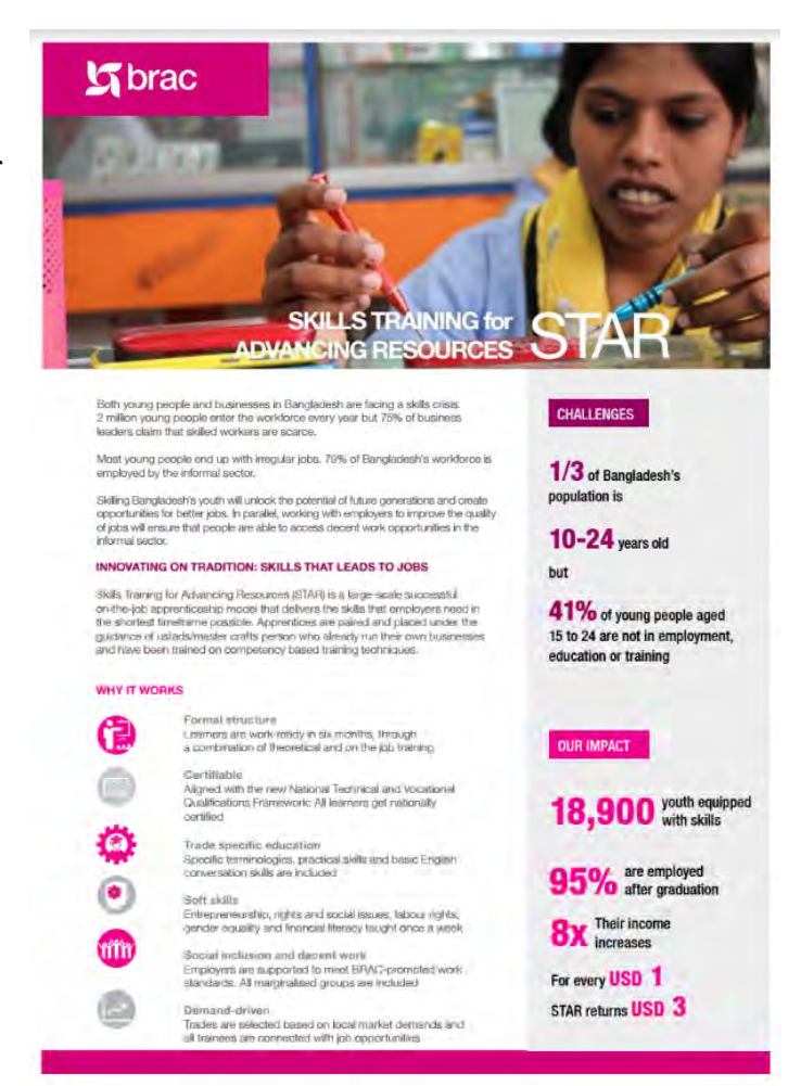
9.1 Fact sheet for BRAC STAR.

look at pictures and graphics that were available. At the initial stage of design, I used to determine the basic shape of the image and the size it would need to be to convey the message. While preparing a fact sheet for the project STAR (9.1), I was instructed to take a photo that could be zoomed in to fit the space of the fact sheet. Following the instruction I took photos, however, taking the learning from the Editing course, even as a beginner I did not squeeze or stretch them as it might cause a distorted image.