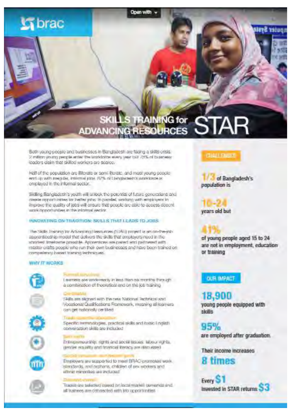
7.2 Front side of BRAC STAR fact sheet.