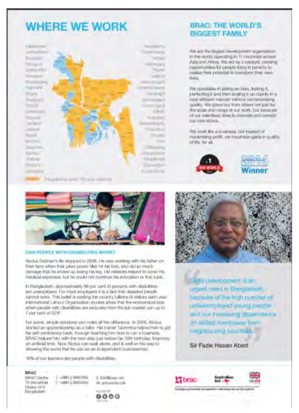
7.3 Back part of BRAC STAR fact sheet.