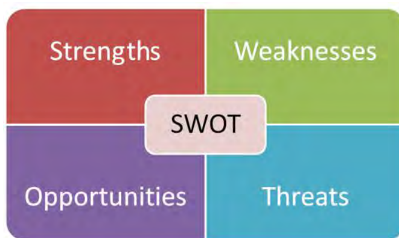
Figure: SWOT Analysis

SWOT analysis aims to identify the key internal and external factors of a company. It brings a positive change for a company. It offers an important overview of how you tackle against the competition so that you can get a competitive advantage by finding out the internal and external factors that could influence the business. So SWOT analysis is very much import for a company.