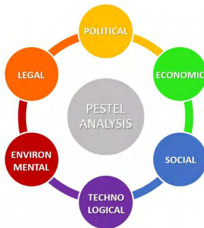
Figure: Factors of PESTEL Analysis

PESTEL is a marketing tool that deals with macro-environmental external factors like- Political, Economic, Social, Technological, Environmental, and Legal factors that might affect a business operation. To analyze freight forwarding industry of Bangladesh, we have gone through those factors in order to find out the elements impacting the logistic services.