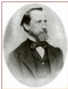
Figure 1: Henri Nestlé