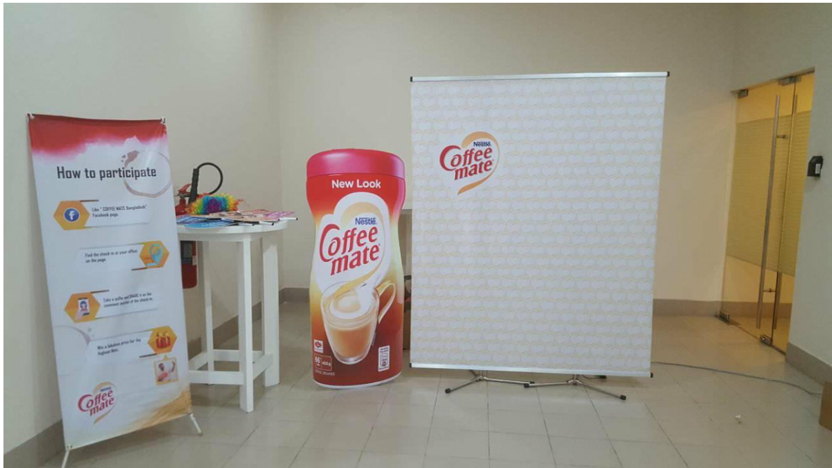
The Photo Backdrop Setup