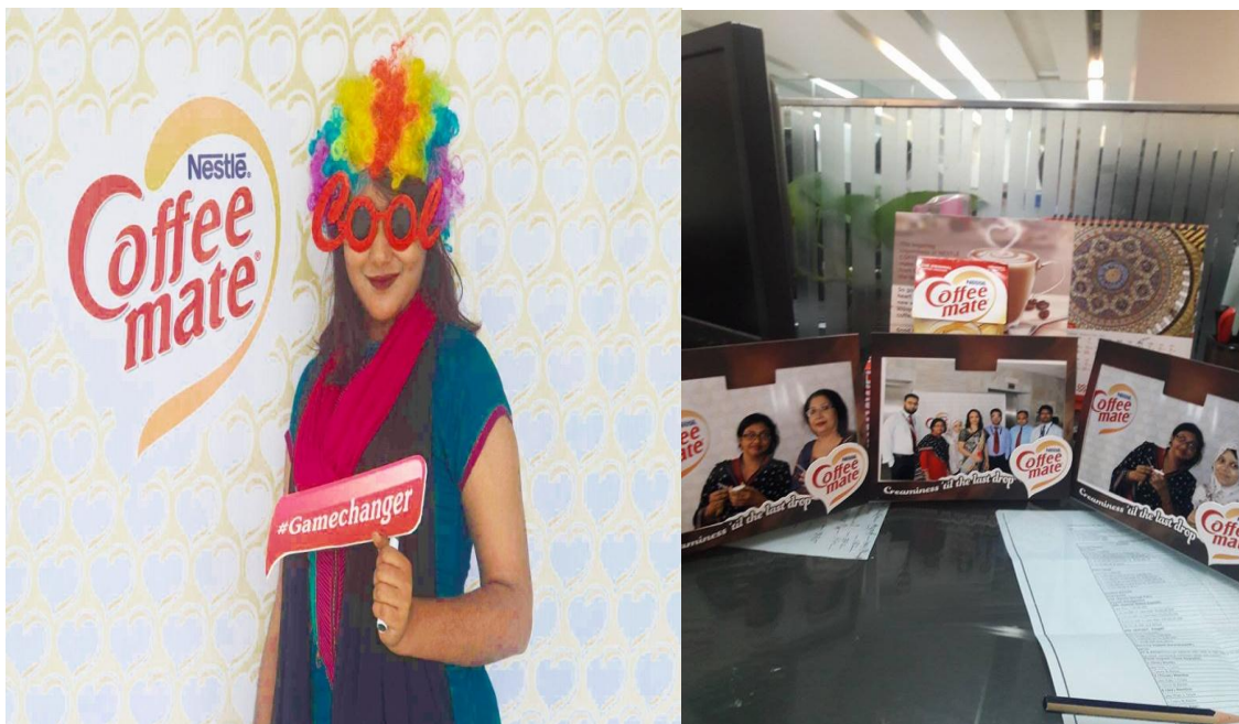
One of the consumer had her photo taken and then printed her photos on our Pixie Corner frames.