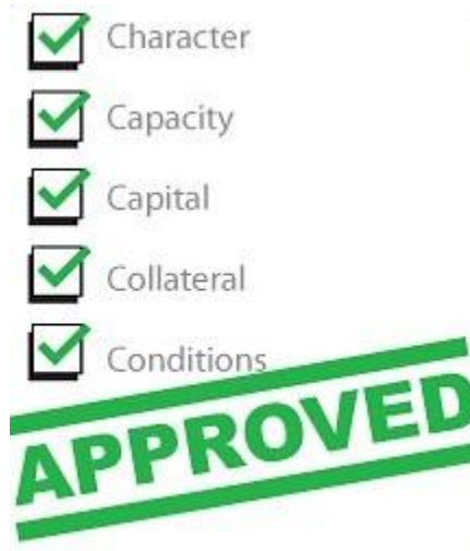
Figure.3: Deciding Factors