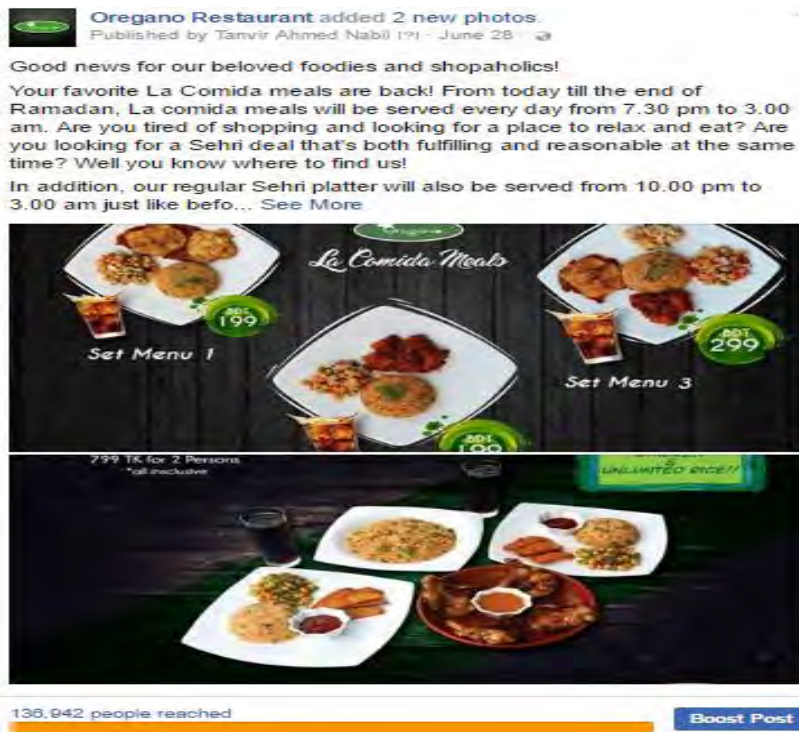
Fig.2 Ramadan offer