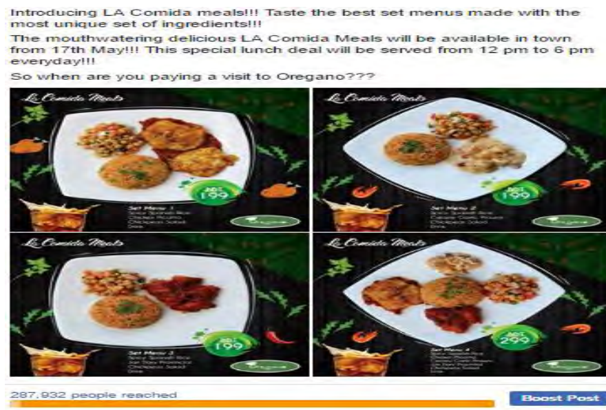
Fig.3 Set Menu

Digital marketing is reaching out to the customer pool in exponential rate as traditional marketing does not allow oregano to reach out to so many customers base.