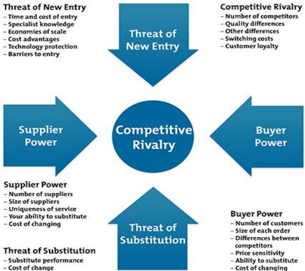
Figure: Five Forces Model

The Porter's Five Forces tool is simple but influential instrument for accepting where power lies in a business situation. It is useful because it helps to know both the strength of firm's current competitive position, and the strength of a position the firm is considering moving into. Typically the tool is used to recognize whether new products, services or businesses have the potential to be advantageous. For developing strategies in many industries Porter's Five Forces Model of competitive analysis is a widely used approach. This model categorizes and evaluates 5 competitive forces that can shape FDL and assist in determining FDL's weaknesses and strengths.