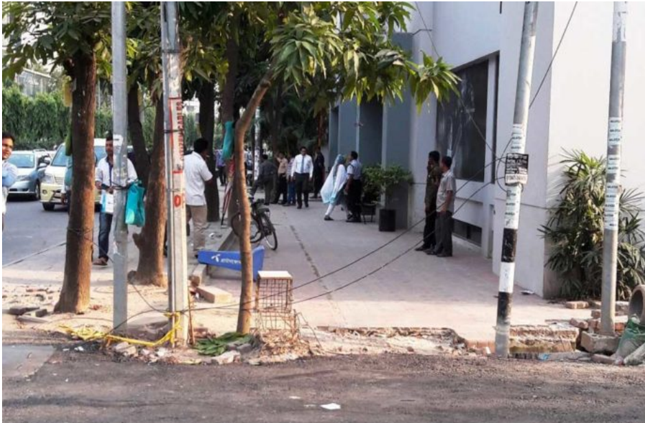
A pathetic effort/COURTESY