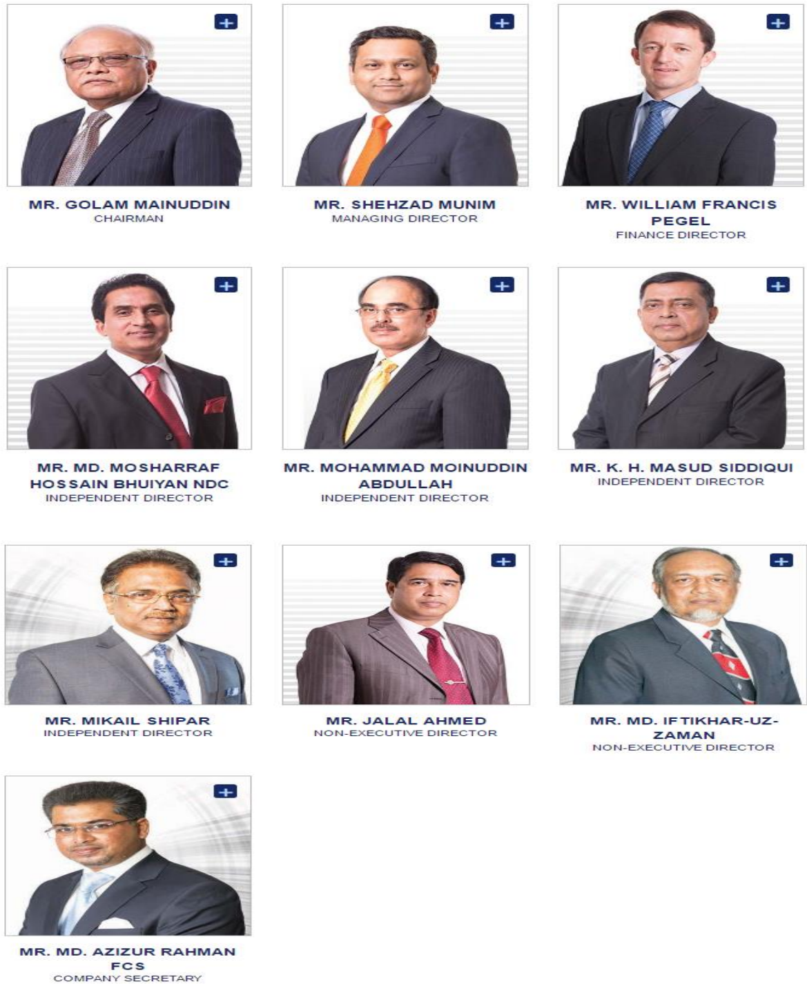
Fig. 2: Board of Directors