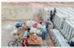
A group of people are gathered around a table, possibly participating in a training session or a community meeting.

Seasonal migration is common among Bangladeshi farmers in response to the fact that it is not possible to grow rice continuously throughout the year. The Shiree program is a seasonal migration program that provides training and support to farmers in Bangladesh. The program is designed to help farmers in Bangladesh to improve their income and living standards. The program is designed to help farmers in Bangladesh to improve their income and living standards.