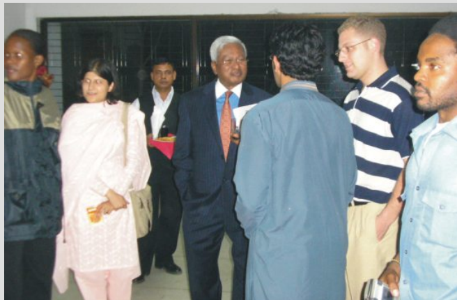
Chairperson of BRAC, Mr. FH Abed speaks to some of the International students during their orientation.

Orientation day for the MPH students of academic year 2006-7 was held at Savar on February 11, 2006. Later that evening, a dinner was organised for the students and invited guests. The Chairperson and founder of BRAC, Mr. FH Abed was chief guest and spoke on this occasion.