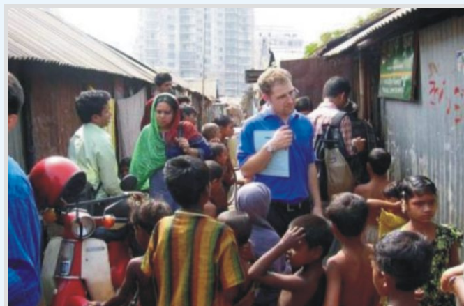
Students on a field visit to an urban slum in Dhaka

The Centre for Health and Population Research (popularly known as ICDDR,B) is one of the most respected health research institutions in the developing world with its stock of highly trained professional staff numbering over 100, field and laboratory facilities, and a library with over 50,000 journal titles and 15,000 books, which is one of the largest and most modern in South Asia. For over 40 years the Centre has conducted high quality research on the health problems of Bangladesh and published thousands of papers in world-class journals. Its laboratories include virology, bacteriology, parasitology, immunology, HIV/AIDS, sexually transmitted infections (STIs) and nutrition, and are located at the Centre adjacent to BRAC in Mohakhali, Dhaka, providing excellent facilities found in very few schools of public health. The Matlab field research area is unique in the world of public health research through its health and demographic surveillance of a defined population of over 200,000, extending back for over 40 years. Participation of the Centre scientists in faculty positions at BRAC SPH offers an ideal opportunity to realise the goals of both organizations as well as to train professionals in the field of public health.