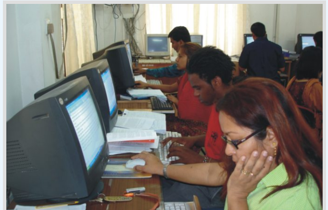
Students at the computer lab in Savar campus

Students spent the entire first semester of six months at the rural facility in Savar, located on 17 acres of land