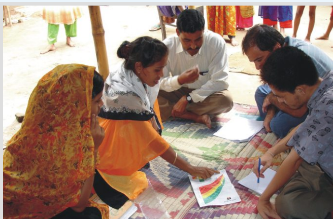
Students visit National Nutrition Programme (NNP) in Bogra during their Nutrition course.

Fieldwork activities are a critical and integral component of the MPH programme. The students spent considerable time visiting a number of field sites in both Savar and Dhaka City during their coursework.