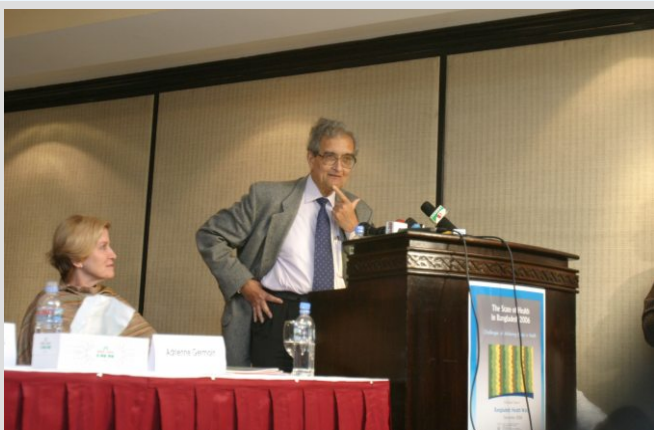
Amartya Sen, Nobel Laureate in Economics, addresses the audience at the launching of the first Health Watch report.

Professor Amartya Sen, Nobel Laureate and Chief Guest, commended the Health Watch initiative. He emphasized that increased slogan of privatization cannot provide health services to all citizens and basic