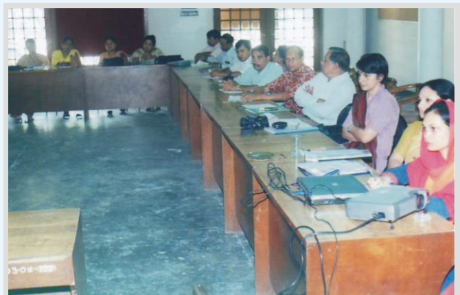
Participants at the Faridpur health providers' workshop.

considered vulnerable in the country. She also presented background history on the evolution of SRH rights (International Conference on Population and Development (ICPD) and Convention on Elimination of all forms of Discrimination against Women (CEDAW)). The second half of the workshop proceeded with a brainstorming session on neglected SRH problems in Bangladesh among the participants, who were divided into three groups. This was