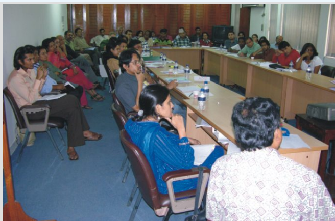
Students are joined by guests at one of their weekly seminar sessions at their ICDDR,B classroom.

The second semester classes of the MPH programme are based in Dhaka at the Centre for Health and Population Research (commonly known as ICDDR,B). ICDDR, B has state of the art laboratories and library. It also provides Internet access, classrooms, office