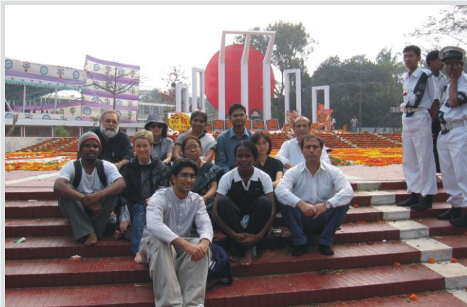
Students take a break from their Introduction to Public Health course to visit the memorial on Language Movement Day (21st February).

As part of the MPH course, the students carried out an independent research study for nine weeks at the end