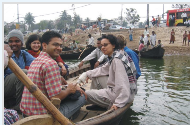
Students return from a visit to an urban slum in Dhaka.

"I'm pleased to inform you that I have been offered a place at Columbia. Thank you very much for all your support."