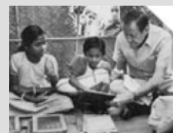
James P. Grant

The late James P. Grant (1922-1995) was the distinguished Executive Director of UNICEF, credited with mobilizing resources to launch the child survival and development revolution that saved the lives of millions of children throughout the developing world. His legacy was in demonstrating the power of applying the art and science of public health. Jim, as he is popularly known, was a good friend of BRAC and Bangladesh and of the people of the developing world, and highly respected and appreciated by all. BRAC University is proud to name the School after him.