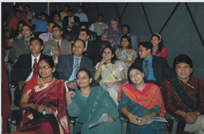
MPH students 2006-07 in the audience at the Graduates Forum.