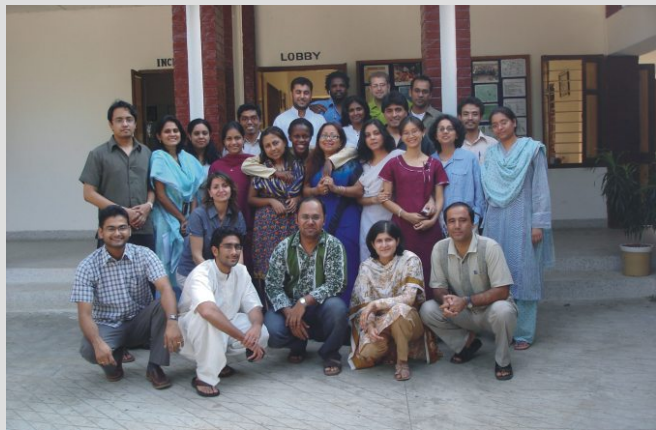
MPH students at Savar campus