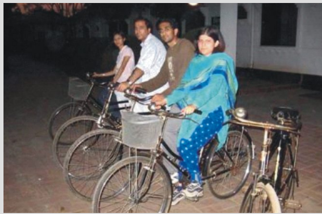
MPH Students leaving for a field visit in Savar

During the 3rd block i.e., independent study, of the MPH programme, supervisors specialized in various fields of public health gave technical advice to the students. The supervisors for the academic year 2006-07 are listed in Annex 4.