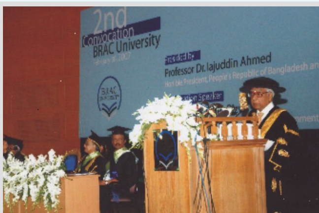
President Iajuddin Ahmed gives opening speech at BU convocation

The President of the Governing Board, Mr. F. H. Abed spoke on this occasion and stated that the mission of BU is to foster the national development process through the creation of a centre of