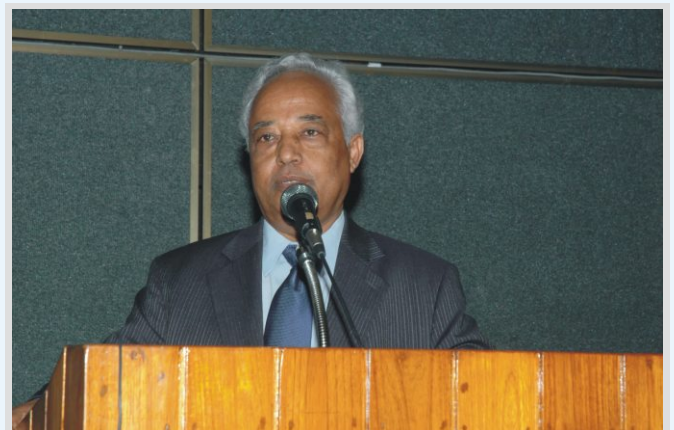
Forum keynote speaker, Dr. Demissie Habte

research project allowing students to integrate their knowledge and learnings on public concepts, tools and practices. The presentations shared findings mainly from Bangladesh on food adulteration, malnutrition among street-kids in Dhaka, mental