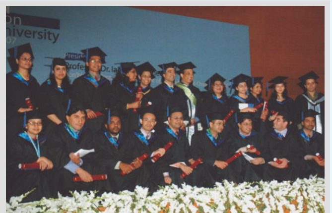
MPH Class of 2006-07

Twenty-six MPH students graduated. Among them, 10 received higher distinction (more than 3.8 CGPA), 7 received high distinction (more than 3.65