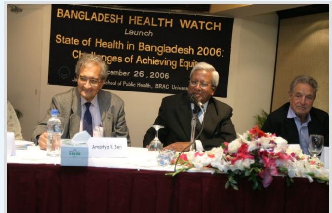
Mr. Fazle Hasan Abed, Chairperson, BRAC, gives his concluding remarks at the launch.

Finally, Mr. Abed, Founder and Chairperson of BRAC,