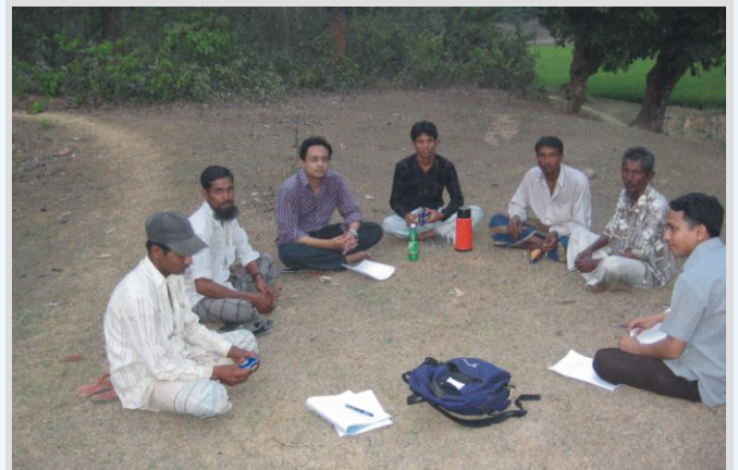
Students conducting fieldwork in Kakabo Village, Savar

Kakabo village in Savar was one of the most important sites where students spent the first six months visiting households, learning public health in practice and employing qualitative and quantitative methods from the medical anthropology and epidemiology and biostatistics courses to improve their own understanding of various health problems affecting the village population.