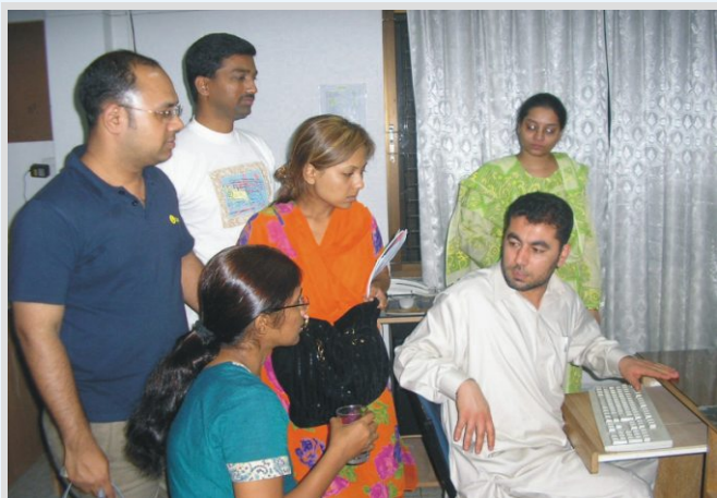
Students engaged in group work at the computer lab In Savar campus.

of the year, conducting primary research on a public health topic of their choice. The purpose of the Independent Study is for the students to demonstrate ability to synthesize and integrate the full range of MPH knowledge and skills at the end of the coursework period through research of a public health problem or programme. Each student carried out research using both qualitative and quantitative skills. Annex 1 lists the titles of these theses.