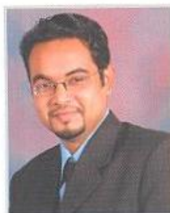
Chowdhury Mushfiqur Rahman