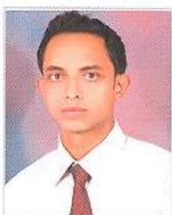
Mohammad Abdus Salam