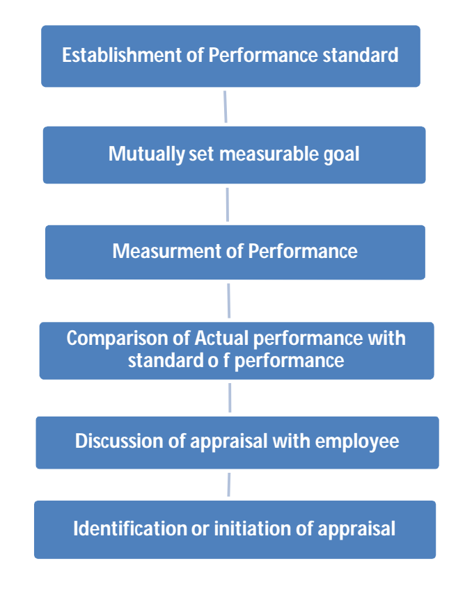
Fig: Performance Appraisal Process in Swan Group

In Swan group the supervisor generally use to initiate performance appraisal of the employees under him/her. Here the standard of performance or the individual goal is set through detail conversation with the employee and the management or supervisor.