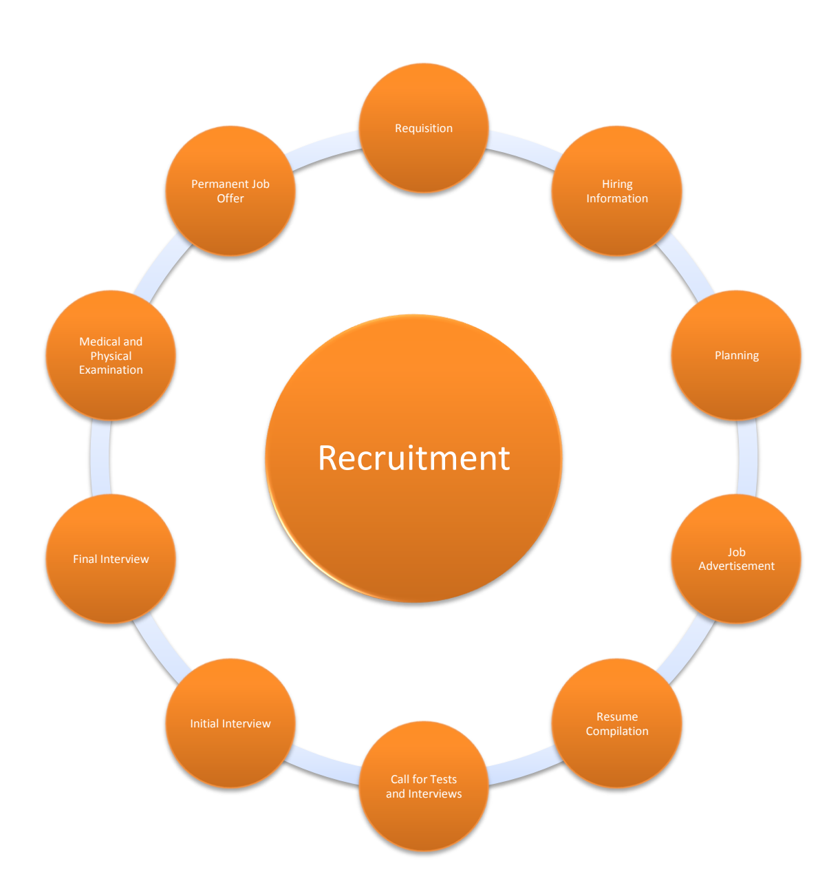
Figure: Recruitment Process of Banglalink